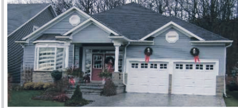
EXEC. BUNGALOW BACKING ONTO GREENBELT $525,500 PresswoodTeam.com 09-454-30 W1726872