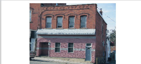
INVESTMENT OPPORTUNITY $479,900 PresswoodTeam.com 09-463-30 W1731126