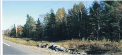
.71 ACRE LOT ON PAVED ROAD $69,900 Marilyn Kerr* 09-471-VL X1774162