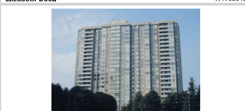
LOOKING FOR A CONDO? $205,000 PresswoodTeam.com 09-442-19 W1719121