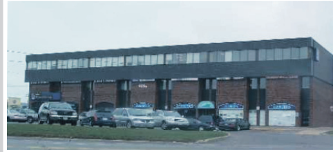
OFFICE SPACE FOR LEASE - GREAT LOCATION! $1,000/Month PresswoodTeam.com 09-118-30 W1704475