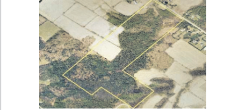
94 ACRES OF PRIME LAND $499,000 David Burland* 07-636-VL W1749497