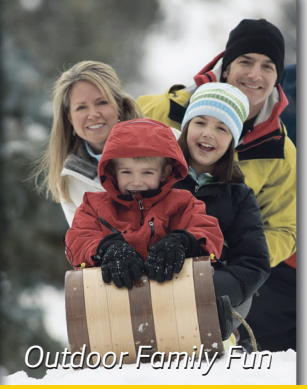
Outdoor Family Fun

Sales Office Hours Monday-Thursday: 12pm - 6pm Friday: closed Saturday, Sunday & Holidays: 11am - 5pm