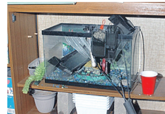
A fish tank that was destroyed in last week's break-in at Robert Little School.