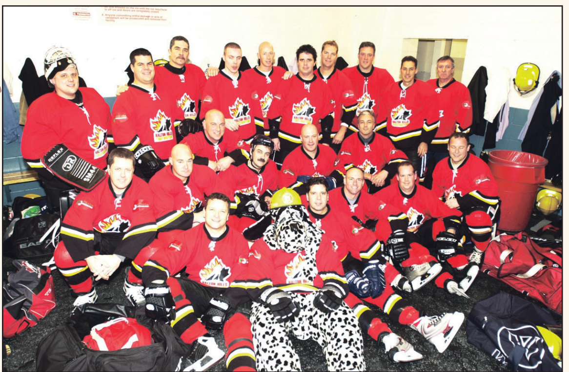
The Halton Hills Firefighters get ready to take on the Leafs Alumni.