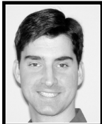
By Cory Soal R.H.A.D.

(Across from the Library and Cultural Centre)