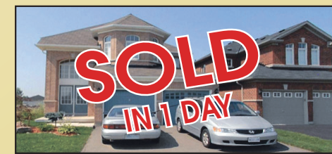
Superb Value on Quiet Crescent-Brampton West. 9 ft. ceilings, crown moulding, open concept. Master has FULL ensuite, massive family room, huge deck, 4 large bedrooms, 3 baths, beautiful chandelier, unspoiled basement. Call The BEZT Team for info today. MLS# W1719631