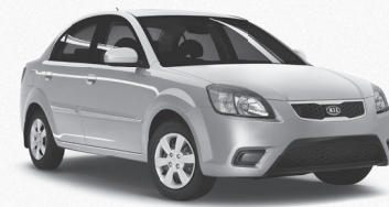
2010 RIO EX CONVENIENCE SHOWN