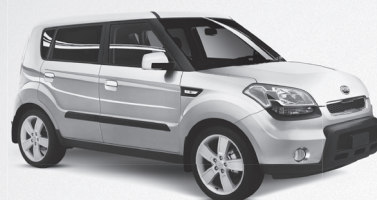
2010 SOUL LX SHOWN