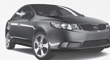
2010 FORTE EX SHOWN