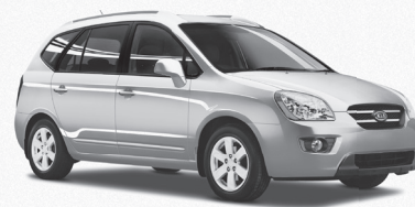
2009 RONDO EX SHOWN