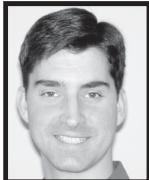
By Cory Soal R.H.A.D.

(Across from the Library and Cultural Centre)