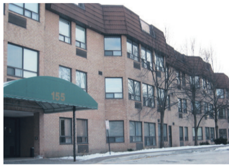
QUIET ADULT LIFESTYLE CONDO $268,900