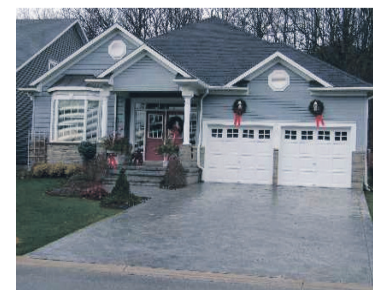
168 Ridge Road, Rockwood Saturday, January 9, 2:00 - 4:00 $539,900