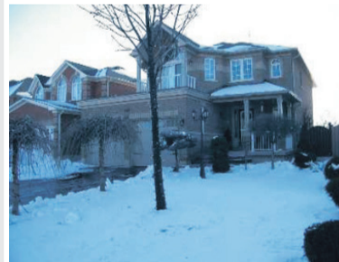
248 Van Kirk Drive, Brampton Sunday, January 10, 2:00-4:00 $419,000