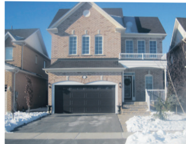
73 Atwood Avenue, Georgetown Sunday, January 10, 2:00-4:00 $524,900