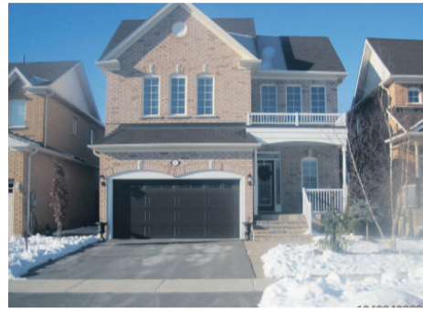
ALL THAT YOU'VE BEEN WAITING FOR $524,900