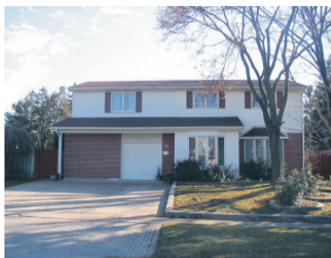
24 Rosefield Drive, Georgetown Sunday, January 10, 2:00 - 4:00 $449,900