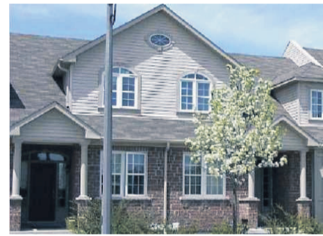
SEE DETAILS @ www.WILLSSELL.ca $334,900