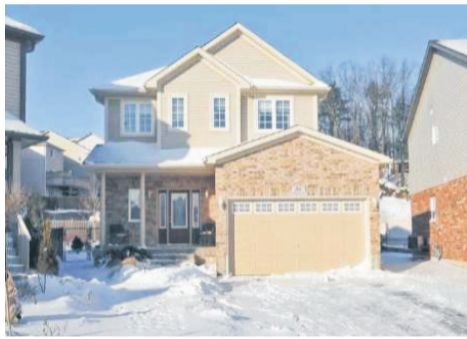
QUIET CUL DE SAC LOCATION $444,900