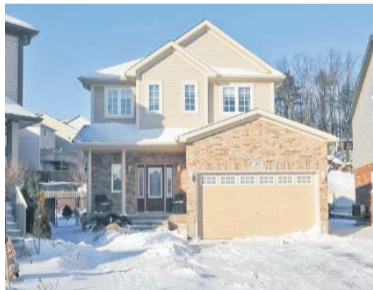
38 Anderson Court, Georgetown Saturday, January 9, 2:00-4:00 $444,900