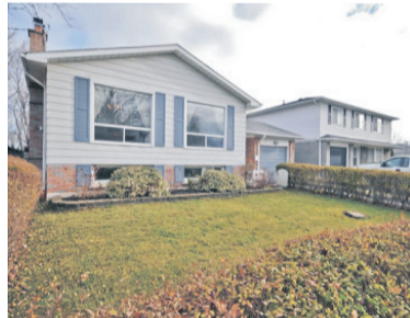
117 Mountainview Rd, Georgetown Sunday, January 10, 2:00 - 4:00 $314,900