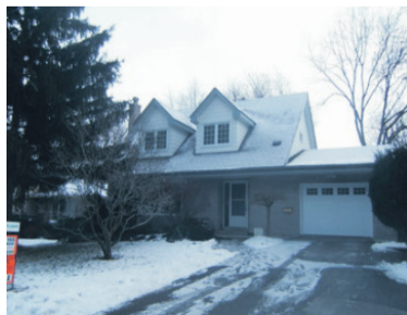
16 Princess Anne Drive, Georgetown Sat Jan 9 & Sun Jan 10, 2:00 - 4:00 $459,000