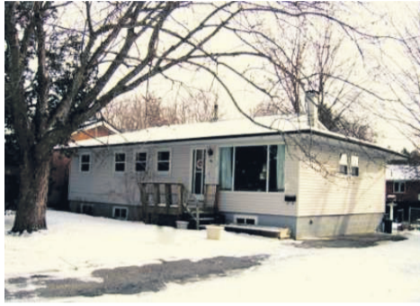
CUTE 2 BEDROOM HOME IN STOUFFVILLE $299,900