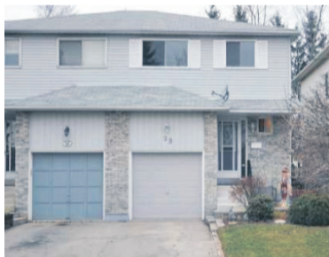
3B Pennington Cres., Georgetown Saturday, January 9, 2:00 - 4:00 $289,900