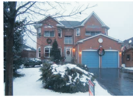
SUPERB AND SPACIOUS $569,900