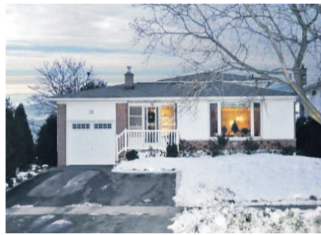
SOUGHT AFTER 4 BDRM COUNTRY SQUIRE $389,900