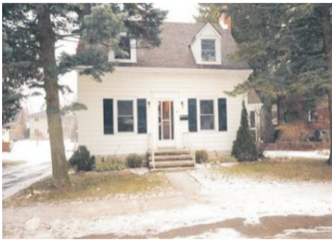
PARK DISTRICT - 3 BEDROOMS $419,000