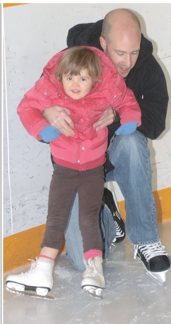
Save me daddy!

"To give you a little information about estimating ice thickness, Canada's Lifeguarding Experts recommend a minimum four inches for walking, six inches for snowmobile and a further eight to 12 inches for a vehicle," said Ford.