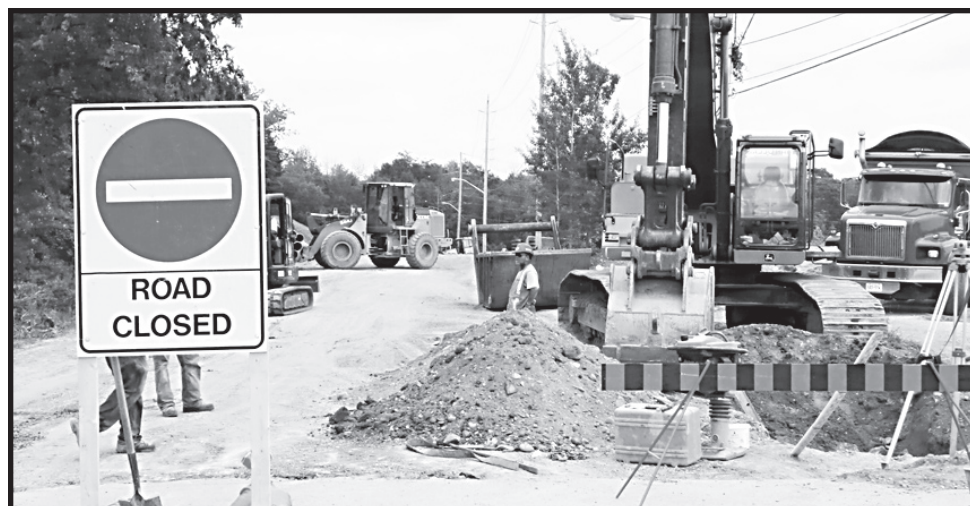
TRAFFIC HEADACHES: It will be a long summer of traffic hassles for motorists in Acton who must deal with the reconstruction closure of Wallace Street, from Dr. Moore Crescent to McDonald Boulevard, and with watermain replacement on Queen Street from Eastern Avenue to Churchill Road.

Another resident asked for maps showing what adjacent municipalities are doing with their