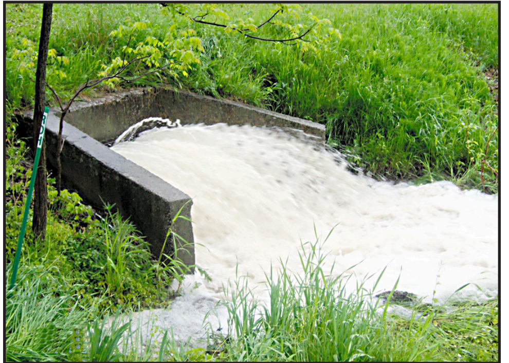
STORM SWAMPED: Saturday's wild weather flooded many streets in Acton, including several in the Lakeview subdivision, where residents attempted to unblock storm water drains.