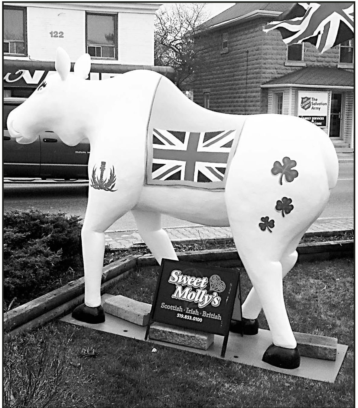
SWEET MOLLY'S MOOSE: This life size moose is now greeting visitors to Sweet Molly's Scottish, Irish and British gift shop at the corner of Mill and Frederick Streets.