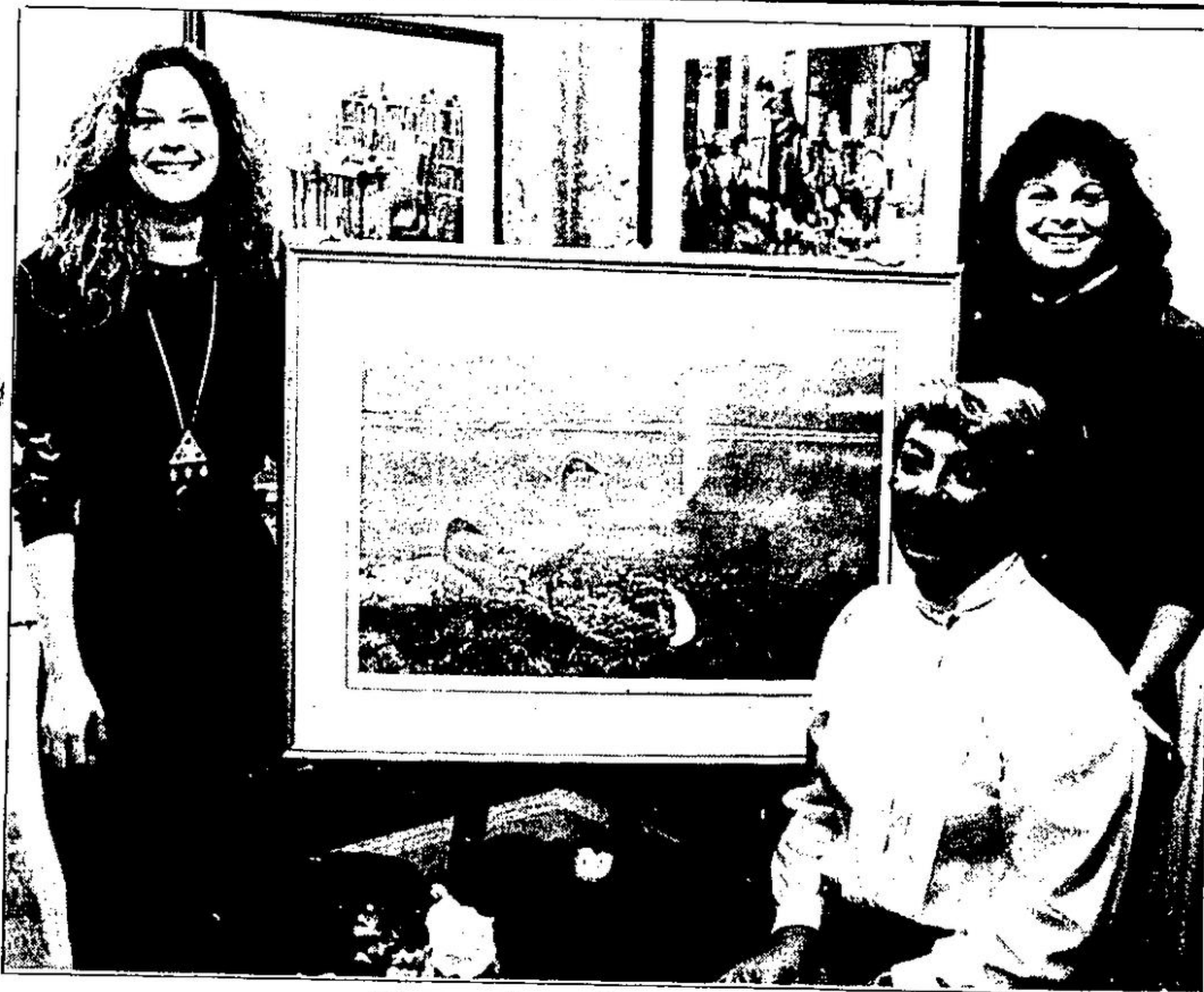
Framing the frame