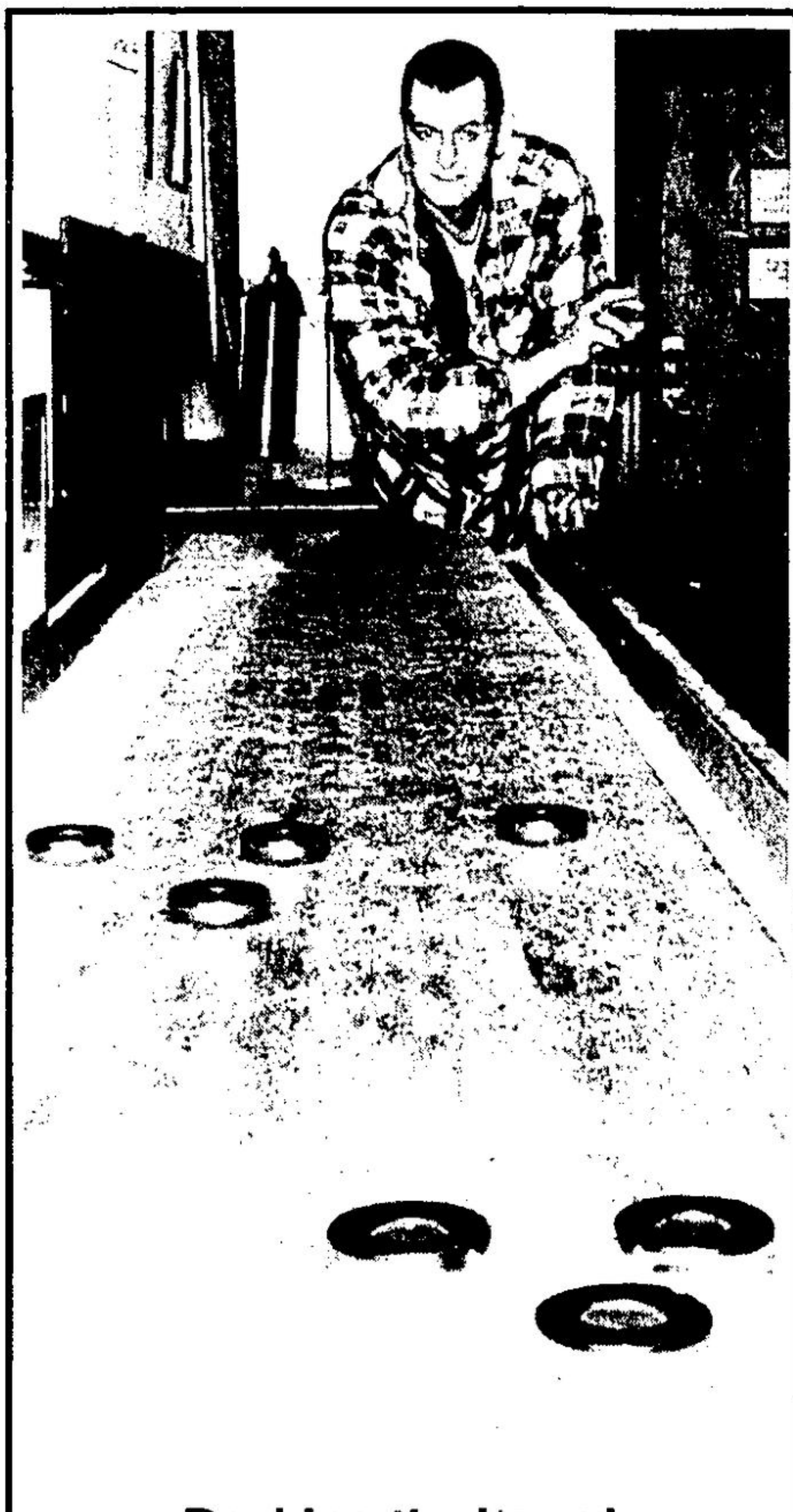
Rocking the board