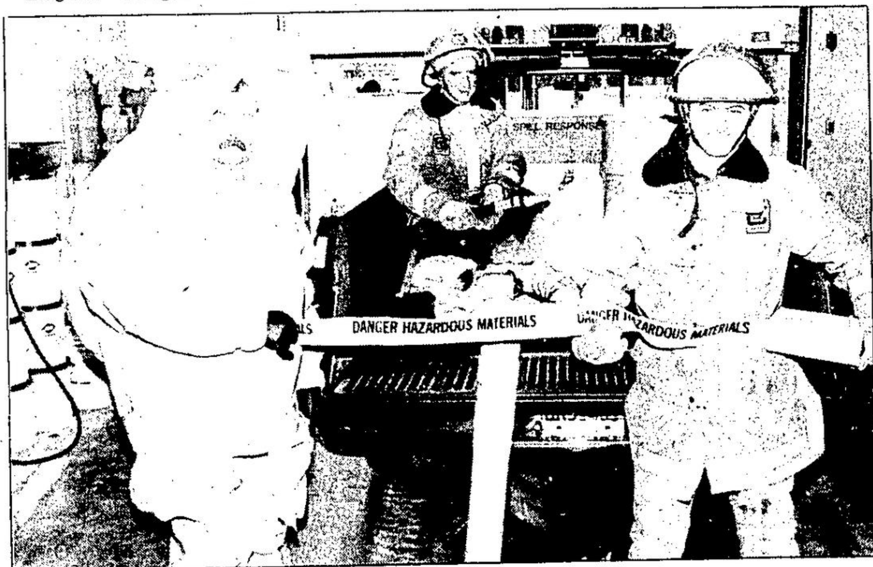
A hazardous team

The decision to turn down provincially-funded day care spaces was