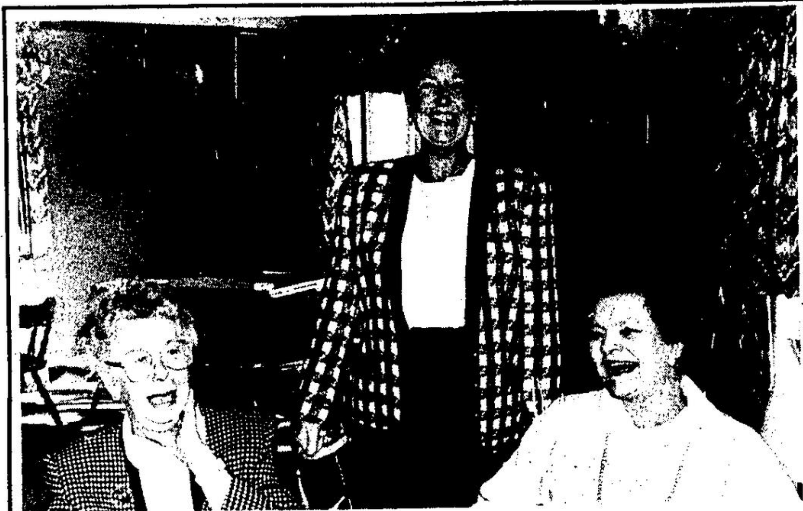
Dressed for success

If you're a Chase fan, or up to your armpits in cranberry sauce and scotch pine needles, then Christmas Vacation might just be the pre-Christmas life-saver that you need.