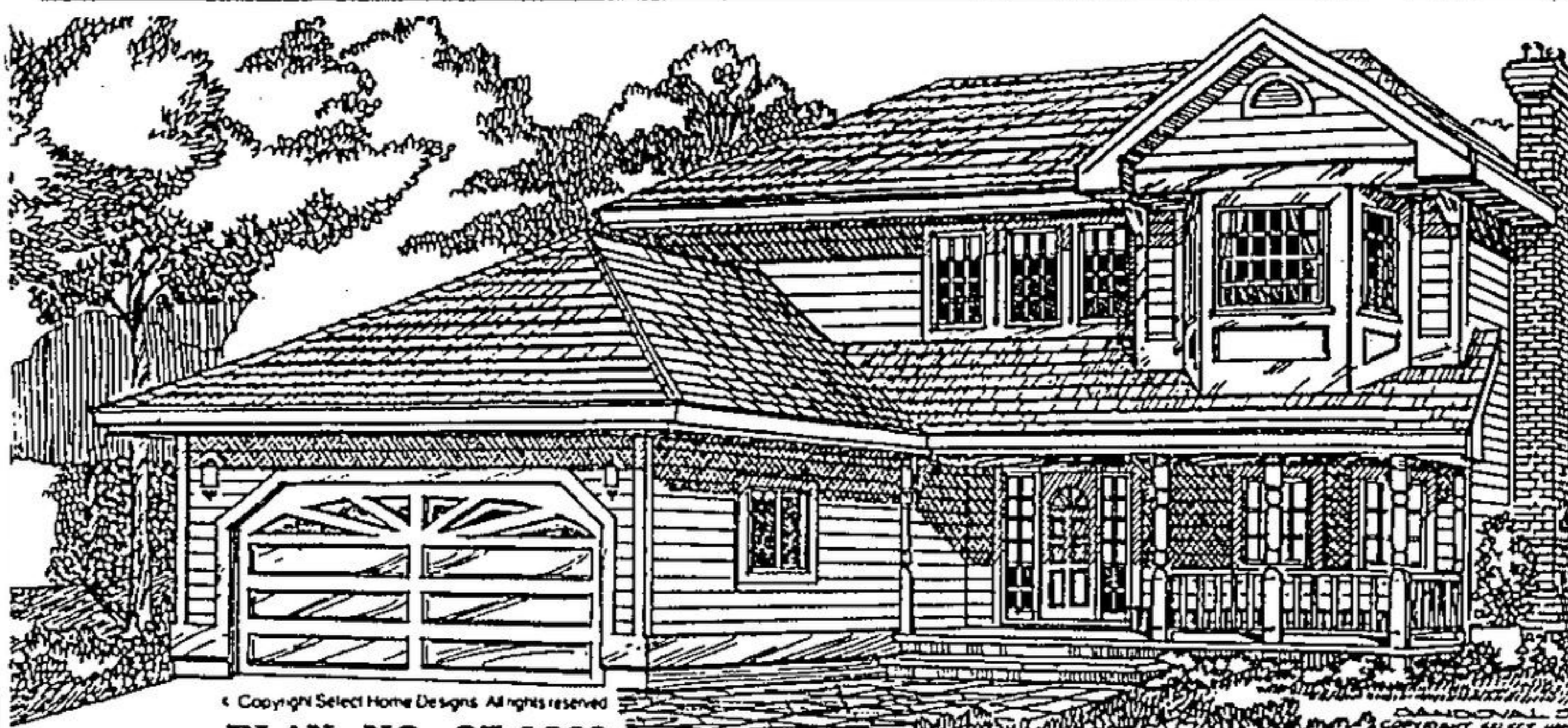
PLAN NO. 87-1869