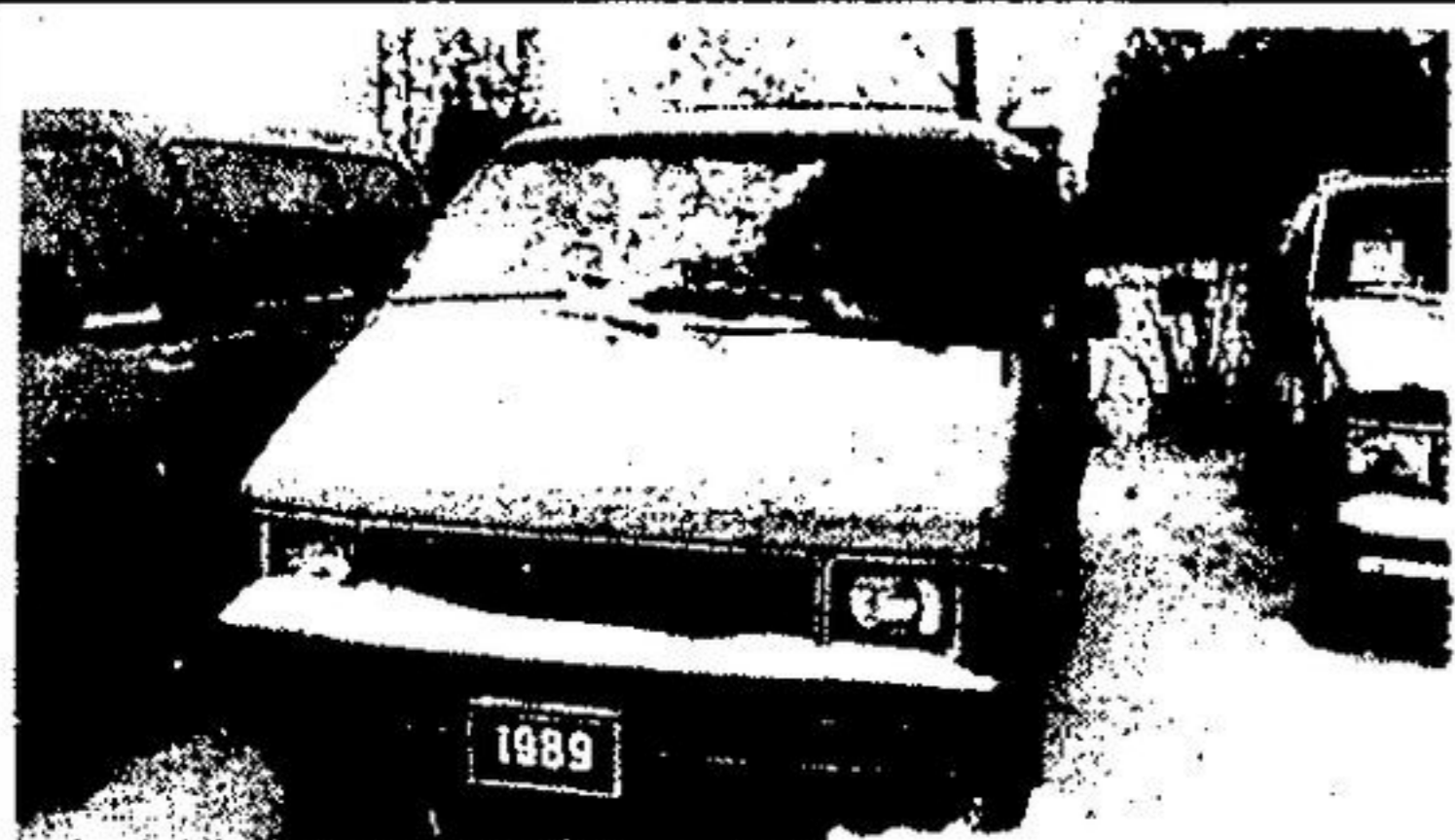
89 AEROSTAR XL 6 Cyl., Air, 7 Pass. Stk. No. 91105