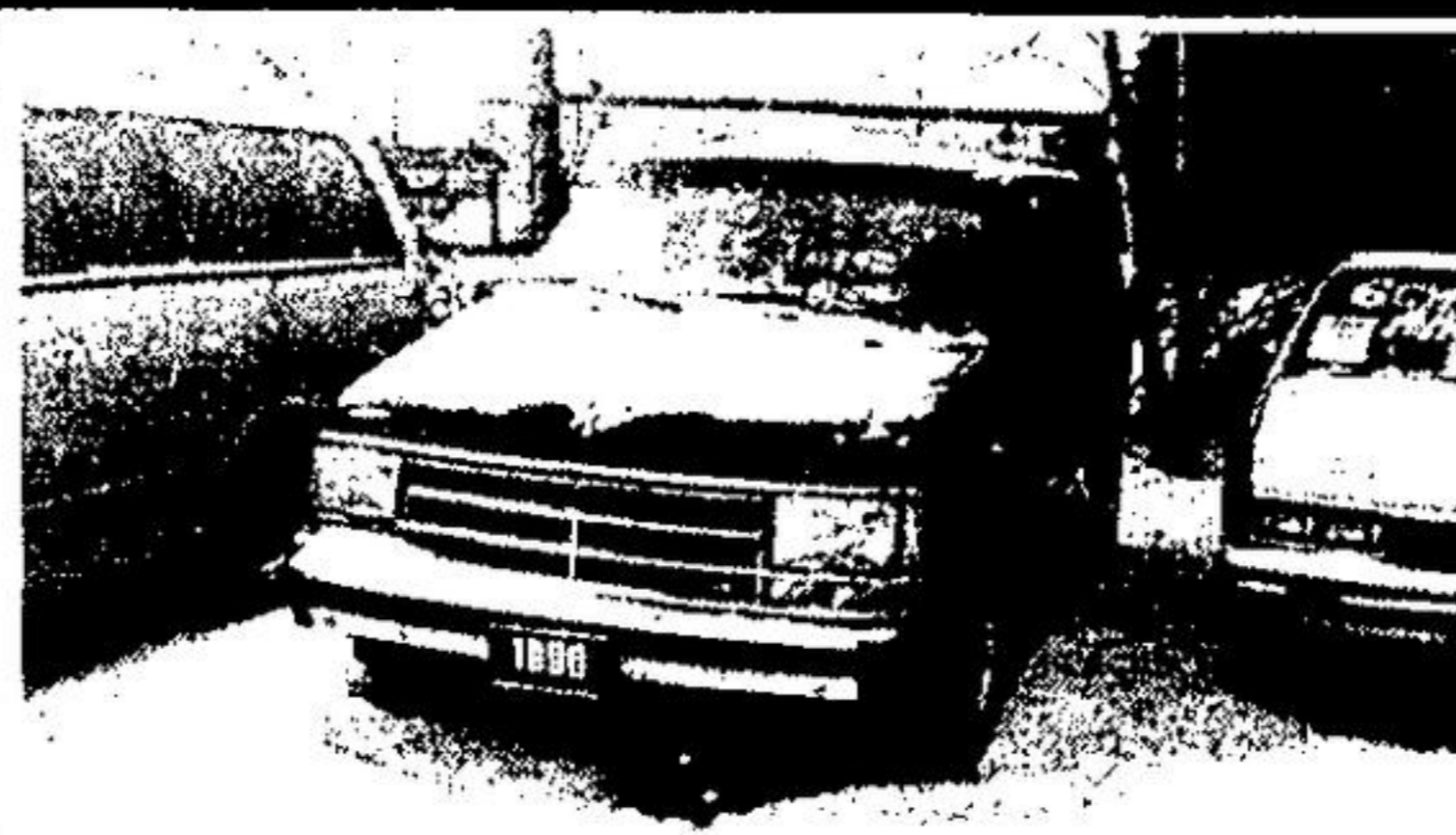
90 CARAVAN 6 Cyl., 7 Pass., Air. Stk. No. 91107