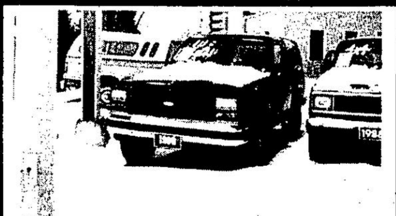
90 BRONCO II 4 X 4 6 Cyl., AM/FM Cass., Tu-Tone. Stk. No. 9201