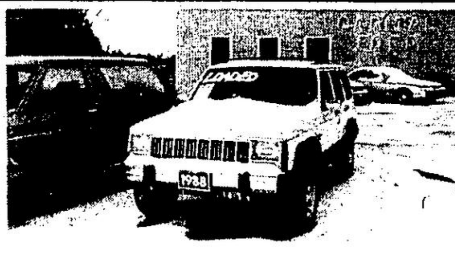
88 JEEP CHEROKEE Laredo, Auto., Loaded. Stk. No. 9206