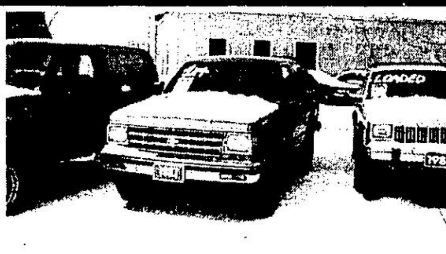
87 CHEV BLAZER 6 Cyl., Auto, Excellent Cond. Stk. No. 9101