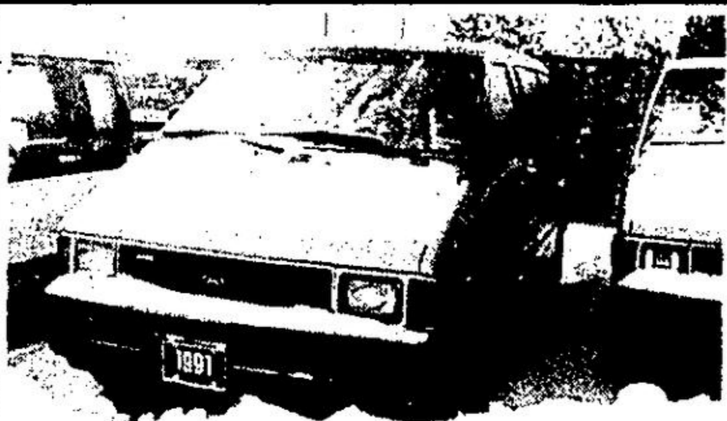
91 AEROSTAR XL 6 Cyl., Tu-Tone. Stk. No. 9196