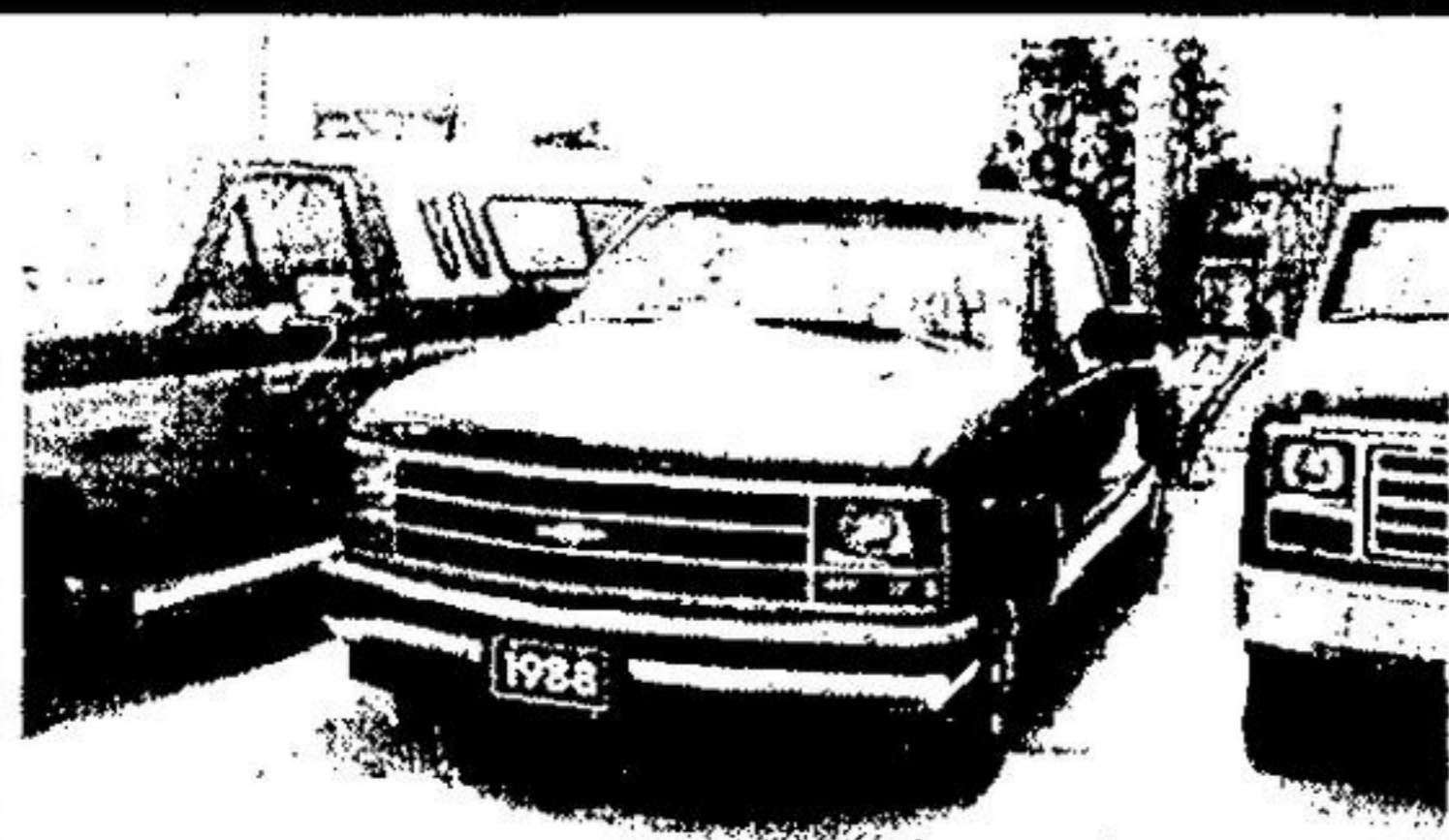
88 CHEV PICKUP 6 Cyl., Stepside, Stereo. Stk. No. 81239A