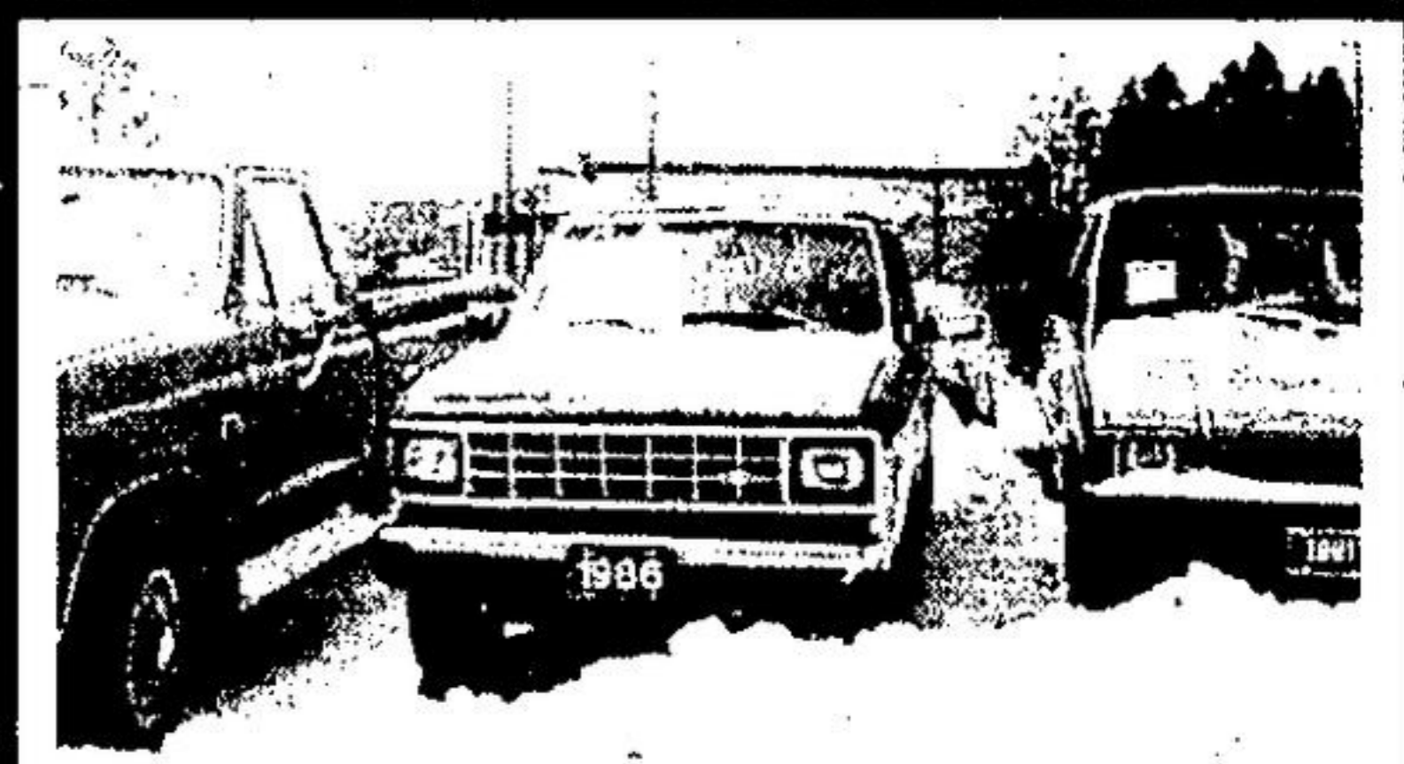
86 RANGER S/C 4 X 4 6 Cyl., Auto, Air. Stk. No. 80194A