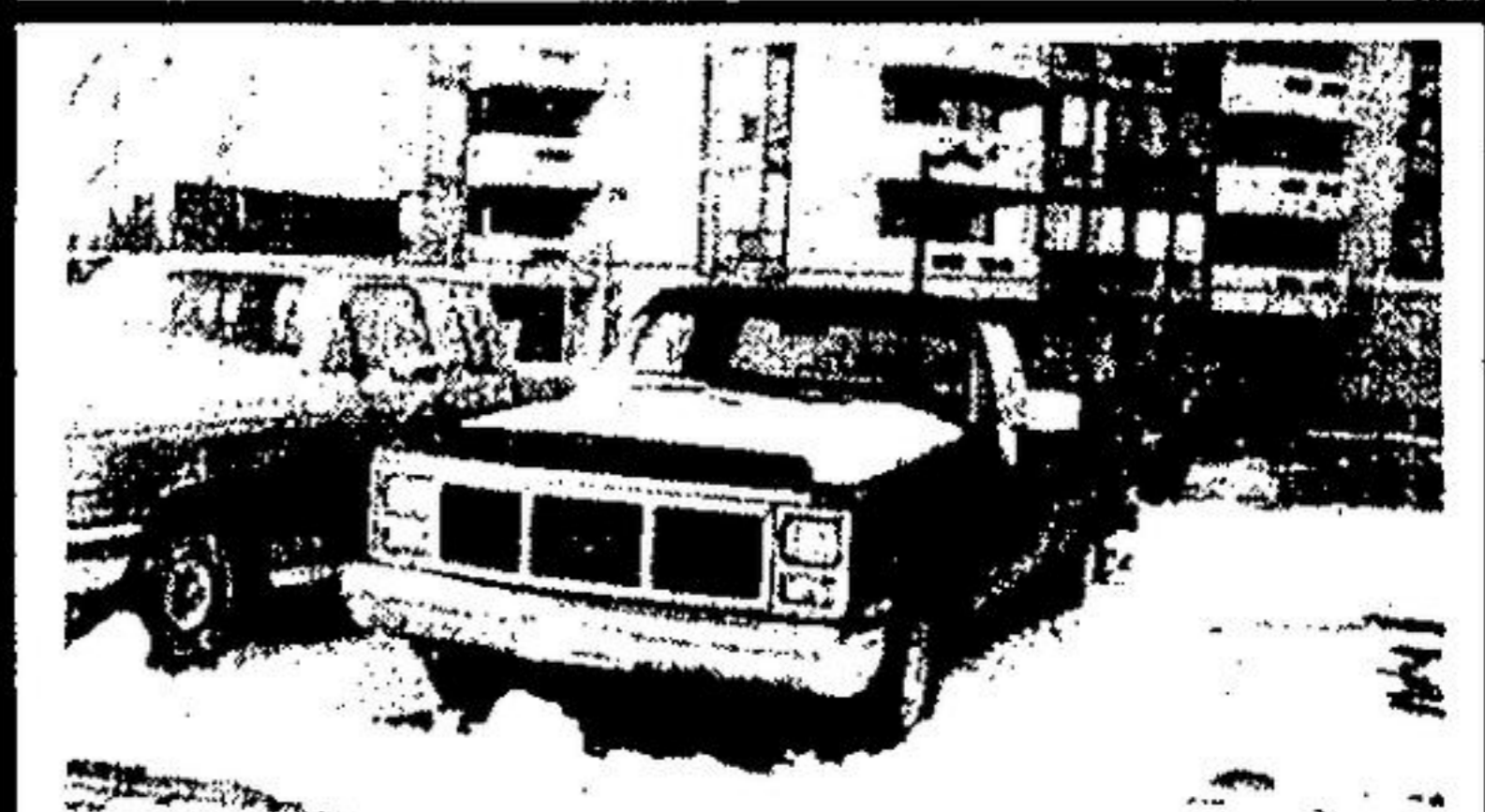
87 GMC PICKUP 8 Cyl., Auto, Low Kms. Stk. No. 8258A