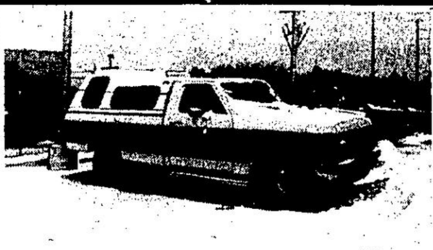
87 F-150 PICKUP XLT V8, Auto, Tu-Tone. Stk. No. 8226A