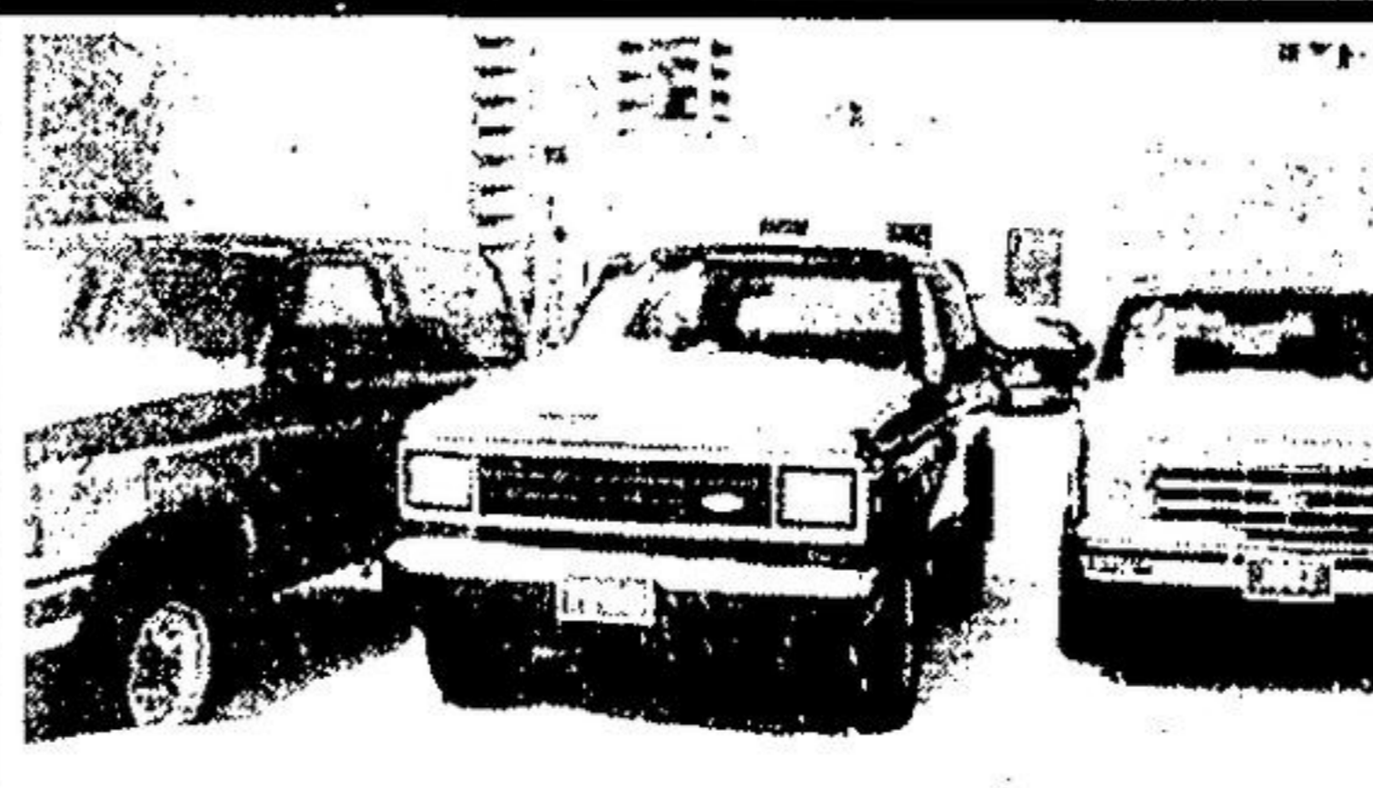
88 BRONCO II 6 Cyl., Auto, 4 X 4. Stk. No. 9202