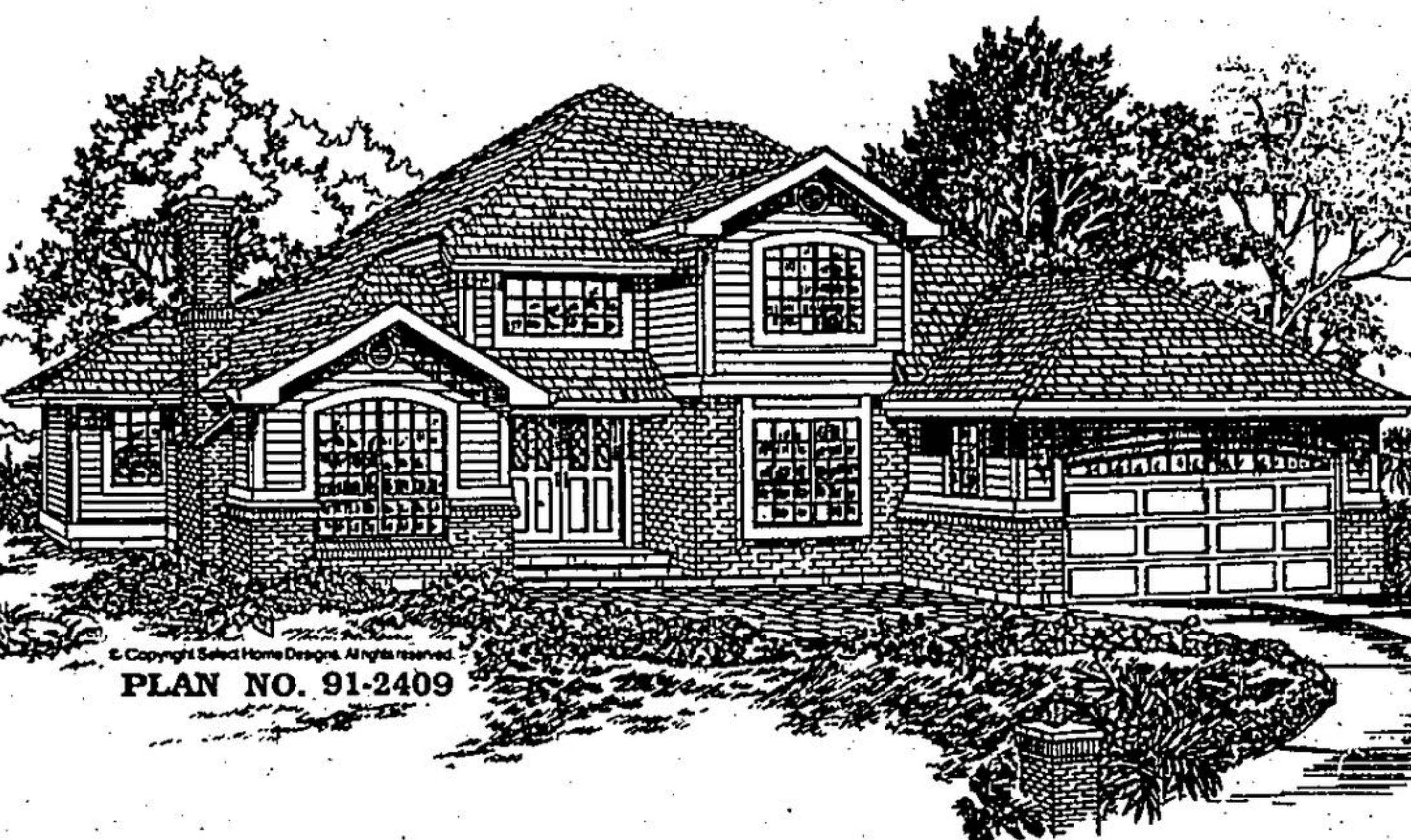
GALLERY VIEWS FAMILY ROOM BELOW