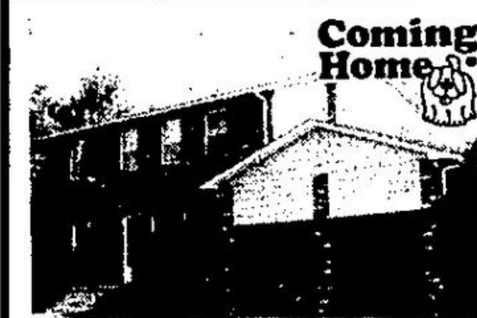
Coming Home 14795 CHURCHILL RD. N

THESE HOUSES MUST BE SOLD BY MIDNITE SUN., DEC. 1st