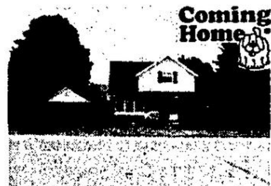
Coming Home 40 ACTON BLVD.