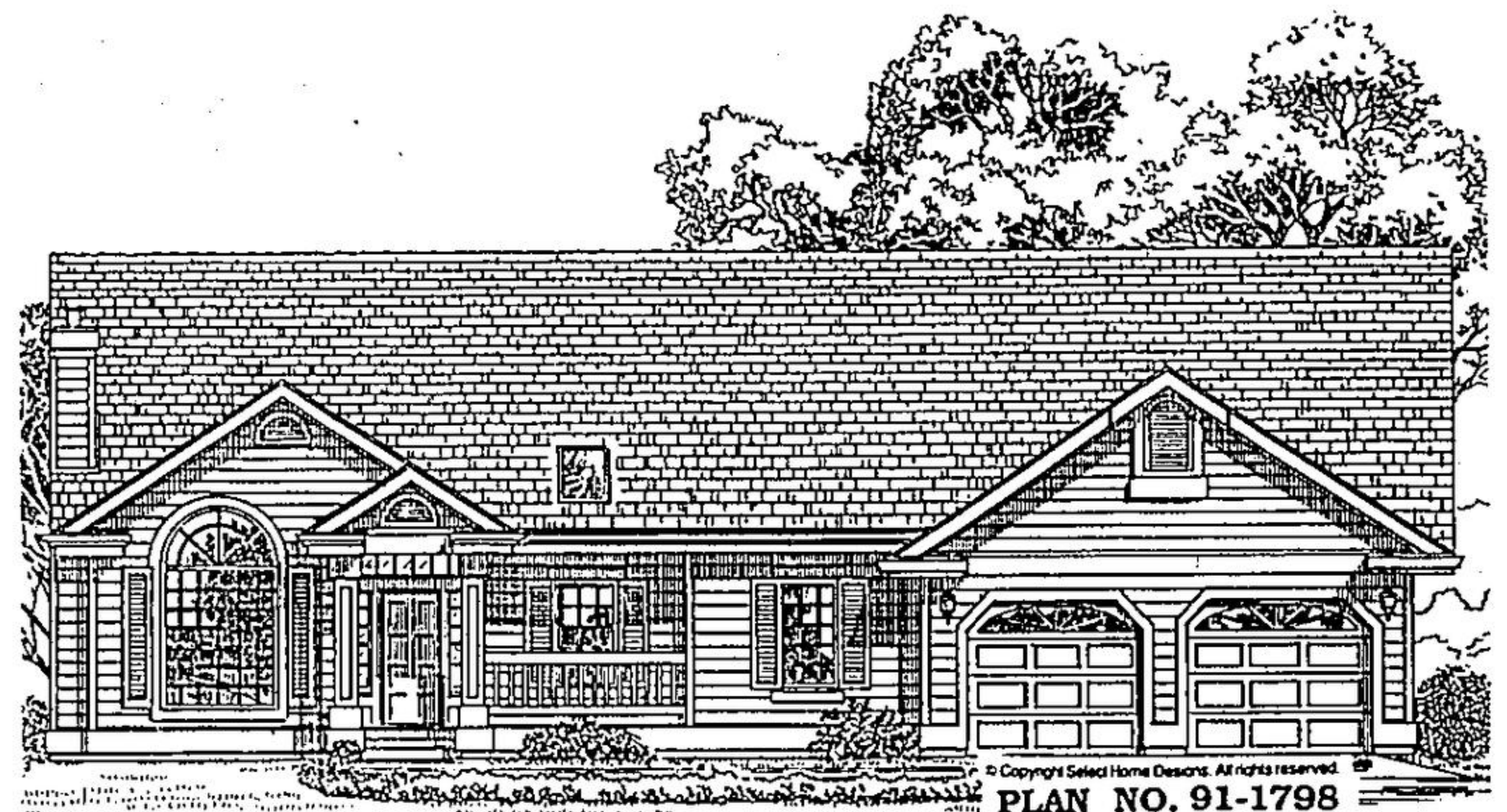
RANCHER WITH A VERSATILE LOOK