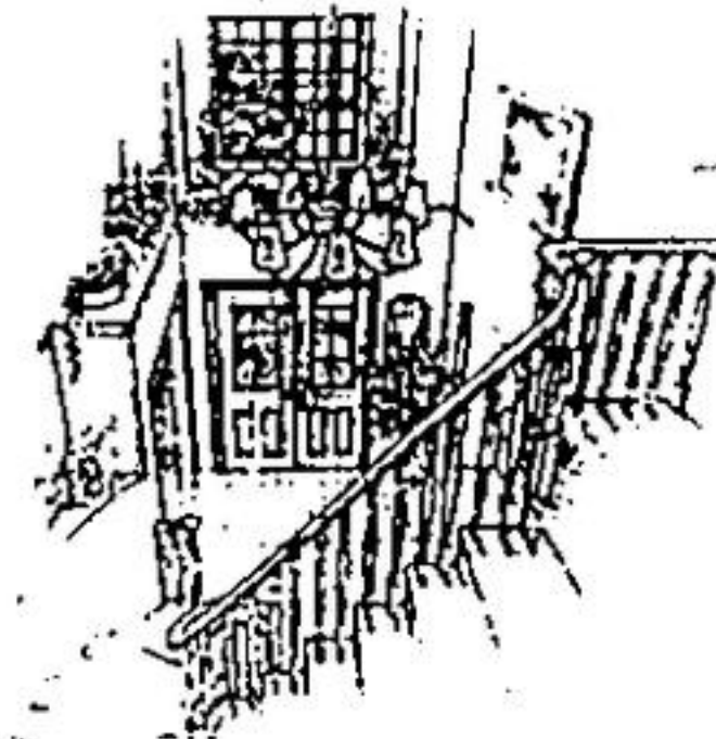
View of foyer from upper hall