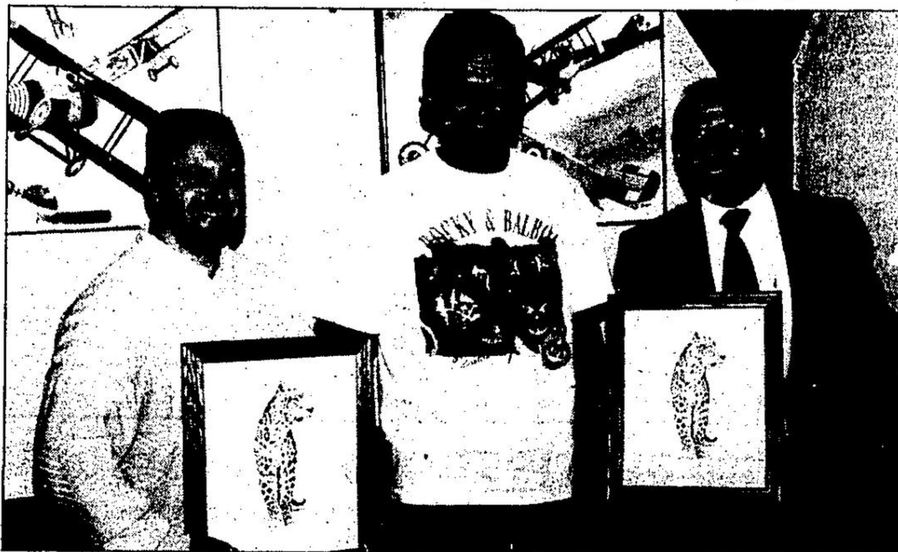
At a recent Halton Hills British/Canadian Club meeting held at the Royal Canadian Legion, presentations were made to several area businesses whose assistance enabled the club to host The Endangered Animal Sanctuary at this year's Georgetown Fall

donations collected will be handed over to local organizations for distribution during the upcoming Xmas season to families within Halton Hills requiring assistance.