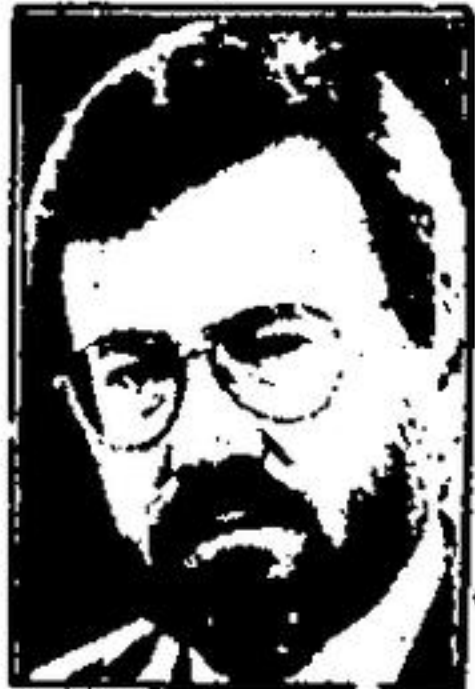
Garth Turner MP Halton-Peel Progressive Conservative

changes, in the name of public safety and security. But I have to tell you that I voted against the gun control legislation when it was brought up for second reading. (I missed the final vote because I was chairing a meeting of corporate executives who had flown to Ottawa from across Canada for the O Canada project - which I'll tell you about soon.)