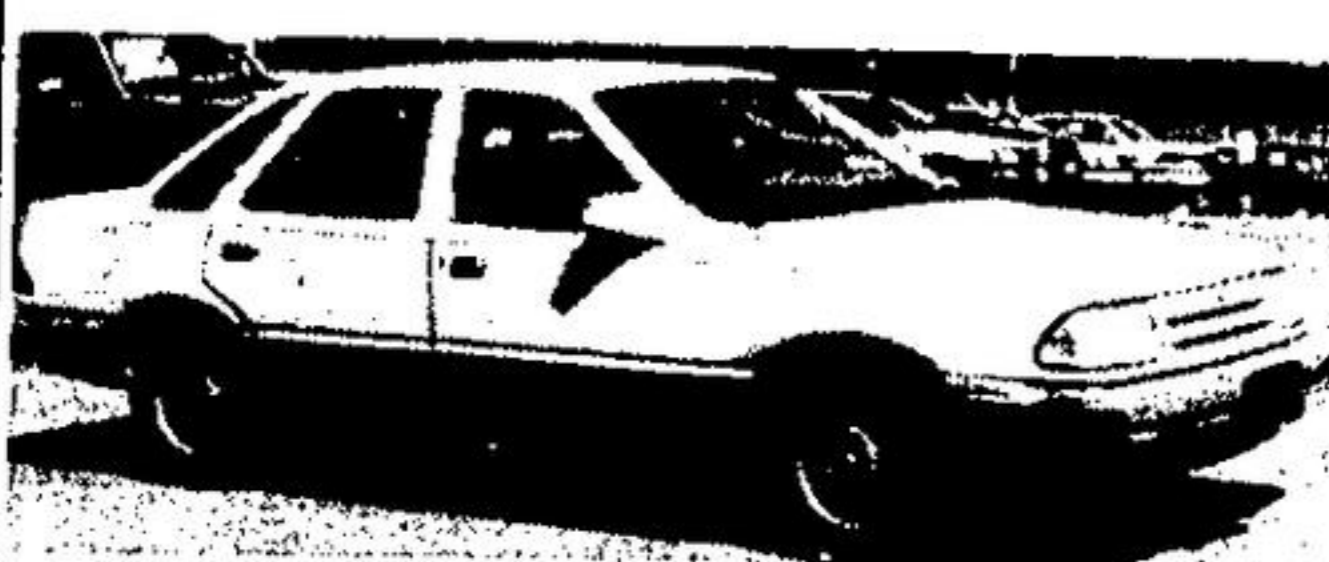
1987 TEMPO 4 DR. - 4 Cyl. Air. Stk. No. 9104