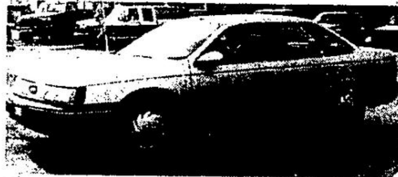
1991 TAURUS - 6 Cyl. Auto, Air. Stk. No. 9131