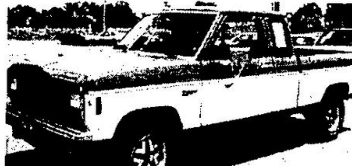
1986 RANGER SUPERCAB - 4X4, 6 Cyl. Auto, Air. Stk. No. 80194A