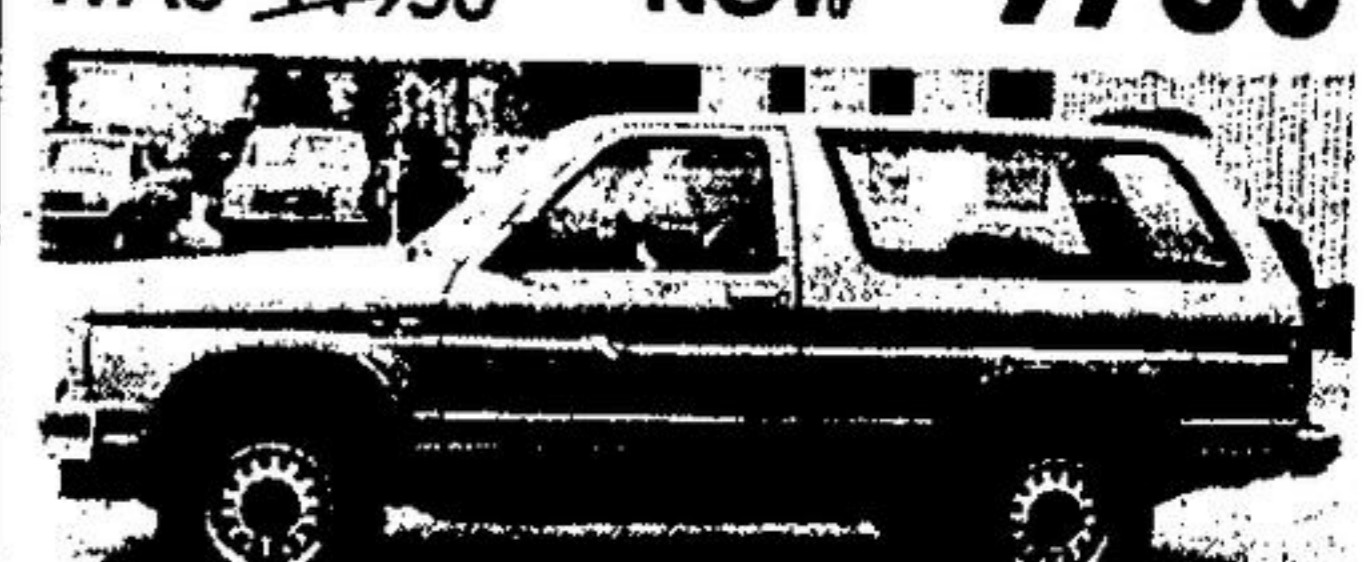
1987 CHEVY BLAZER - 4X4, 6 Cyl. Auto. Stk. No. 9001