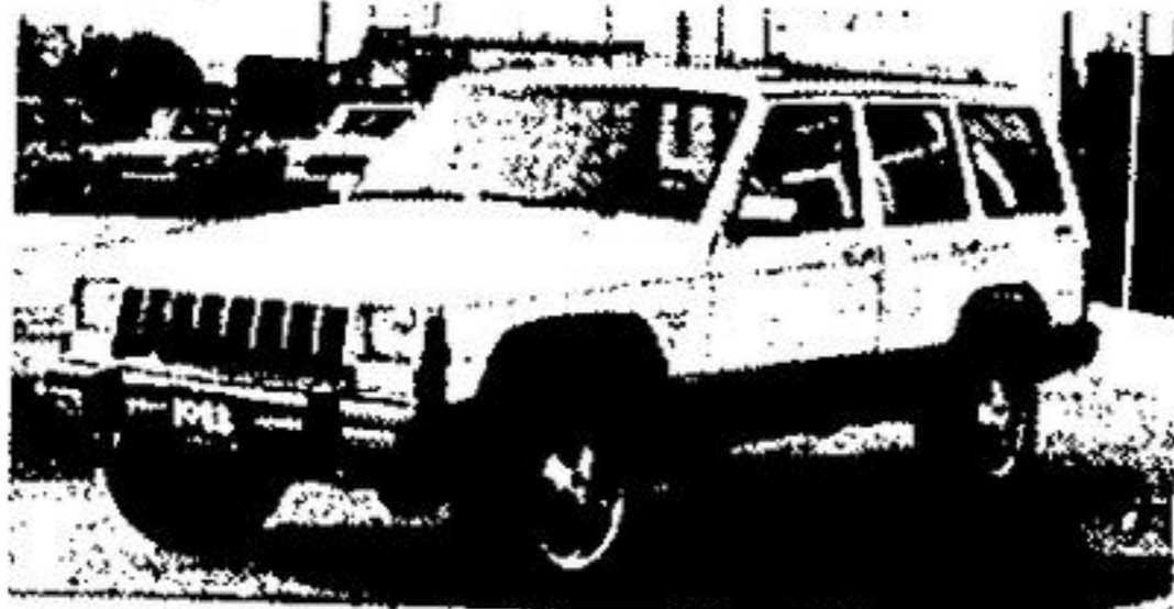
1988 JEEP CHEROKEE - 4X4, 6 Cyl. Loaded. Stk. No. 9206