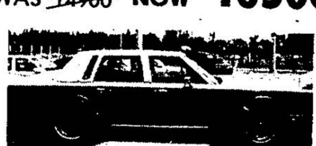
1987 LINCOLN TOWNCAR - 8 Cyl. Loaded. Stk. No. 9125