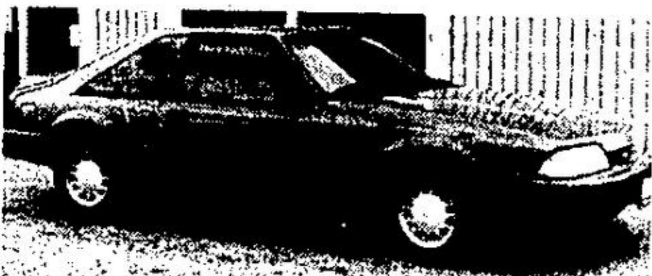
1989 MUSTANG LX - 4 Cyl. Air. Stk. No. 4133A