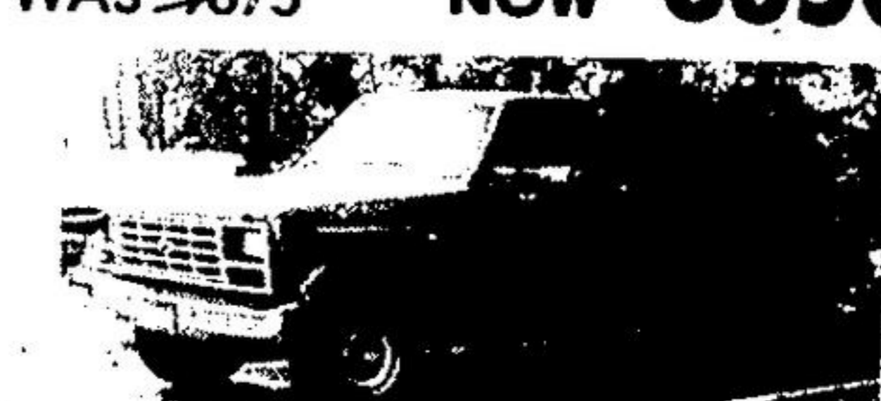
1986 F-250 - 8 Cyl. Auto. Stk. No. 90145