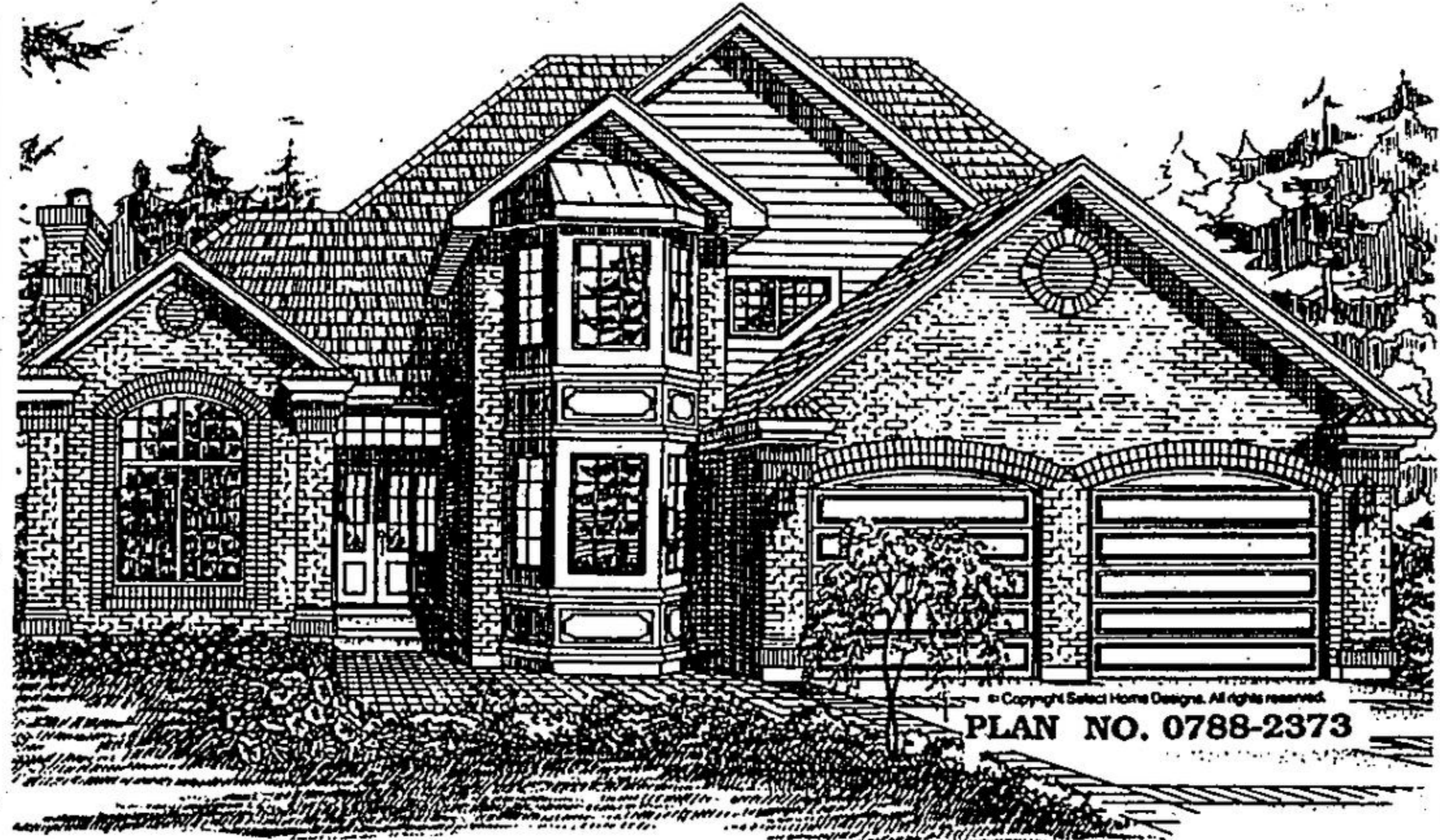
PLAN NO. 0788-2373