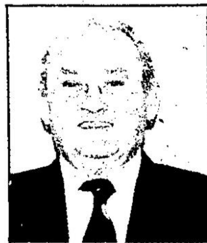
"The man you can count on!"