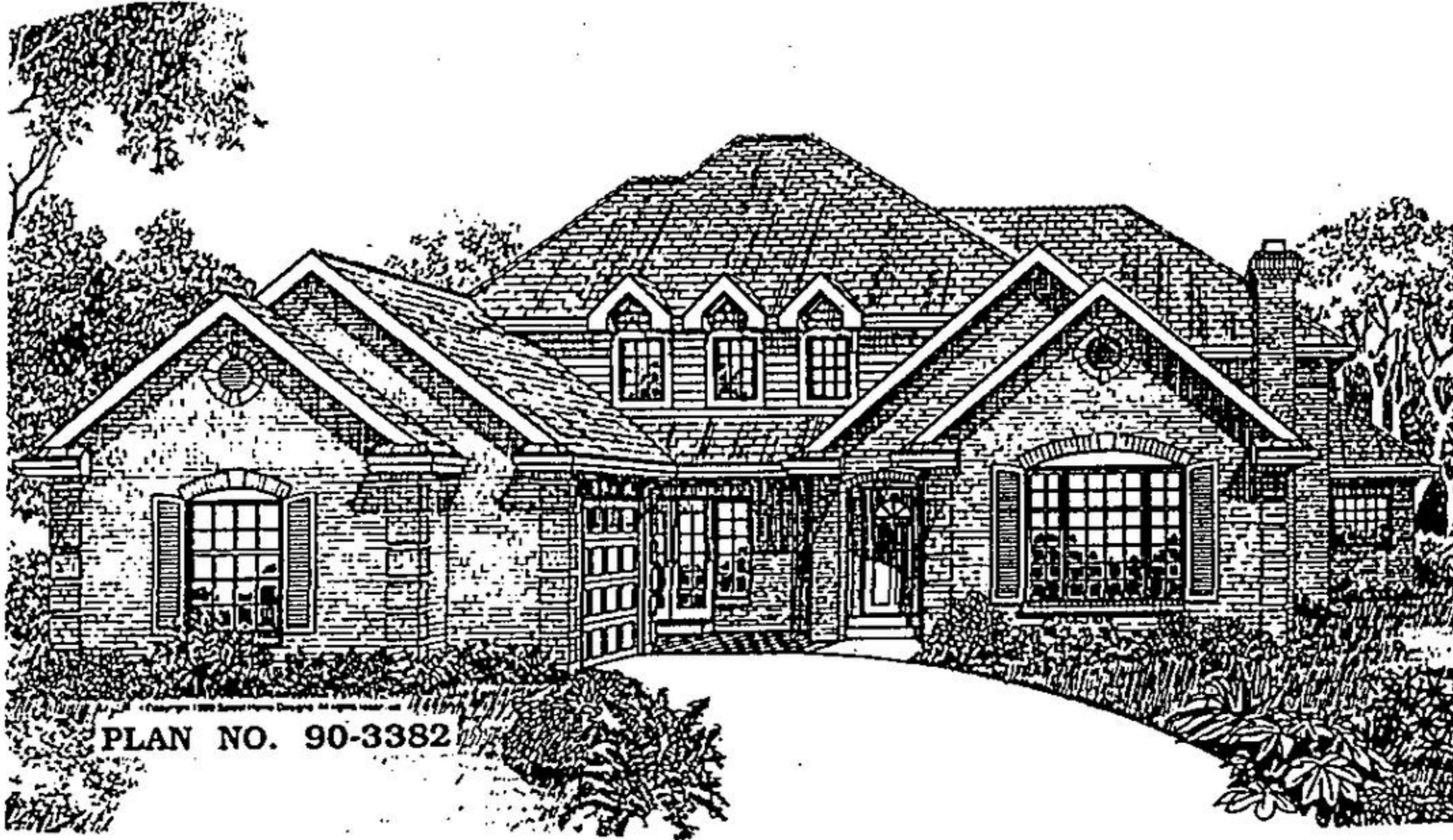
PLAN NO. 90-3382

Brought to you by: HALTON HILLS MECHANICAL - 873-2137