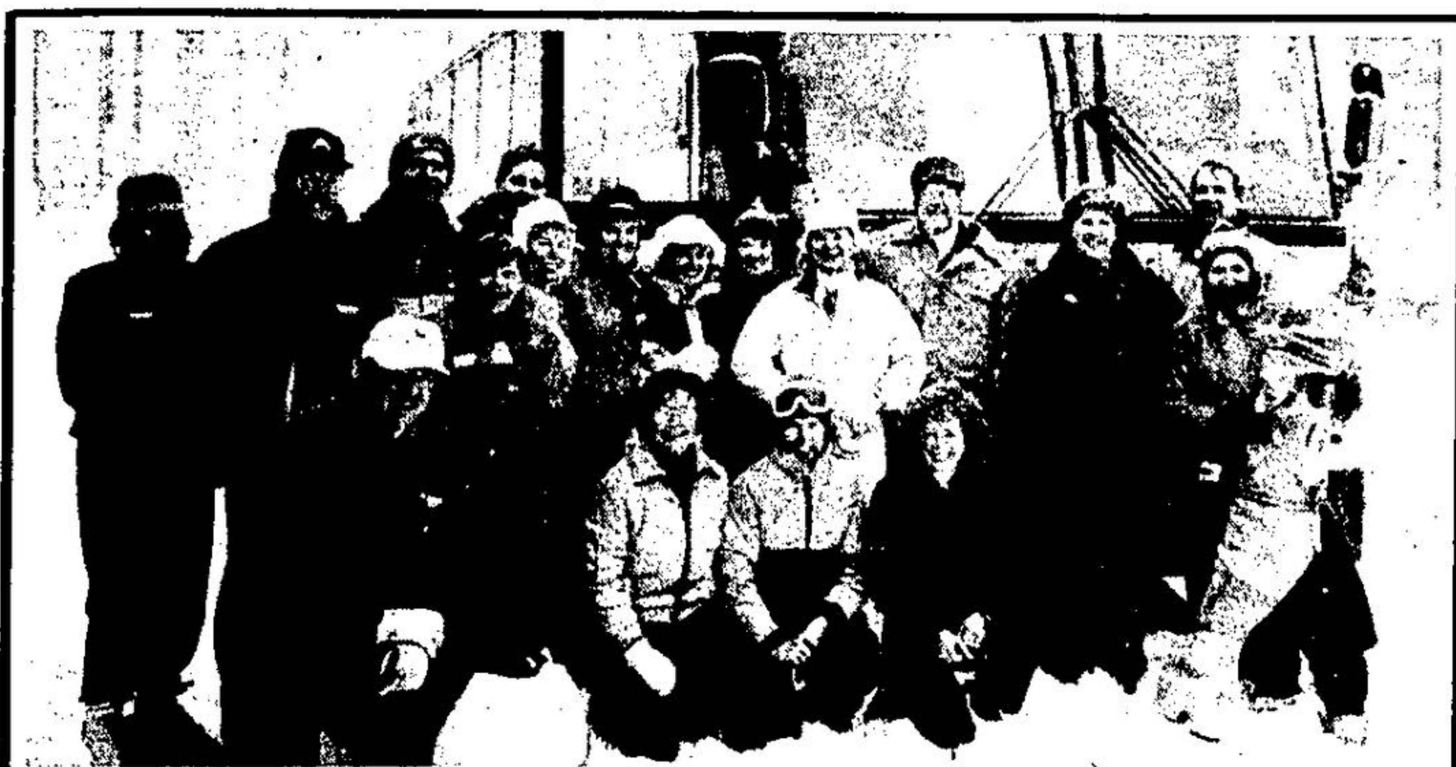
Eagerly awaiting winter

The program serves to remind participants that the Legion cares for them not only as athletes, but as citizens as well.