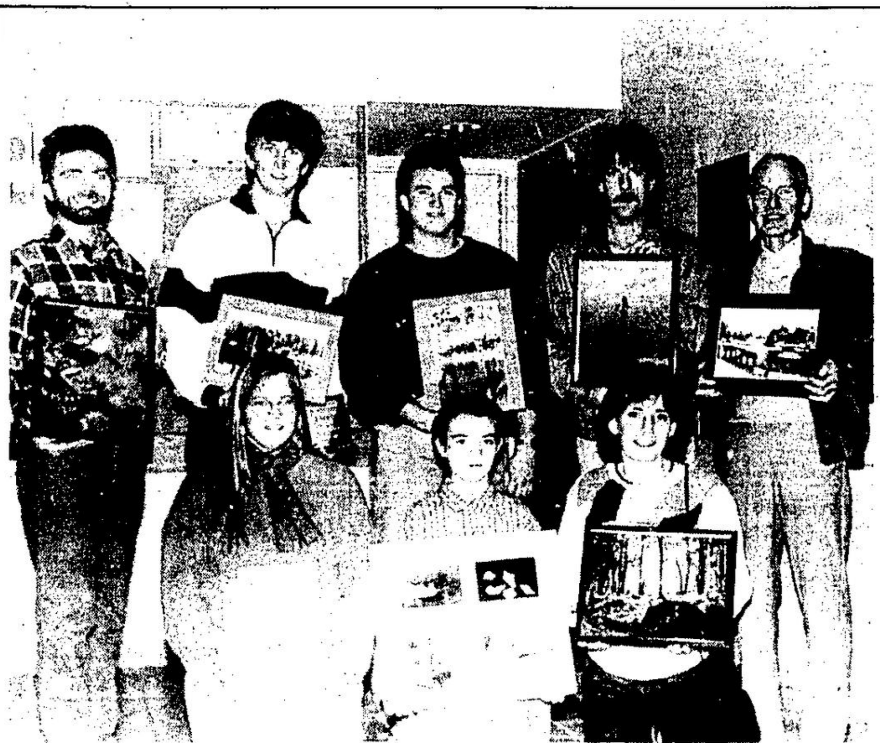
Photo contest winners