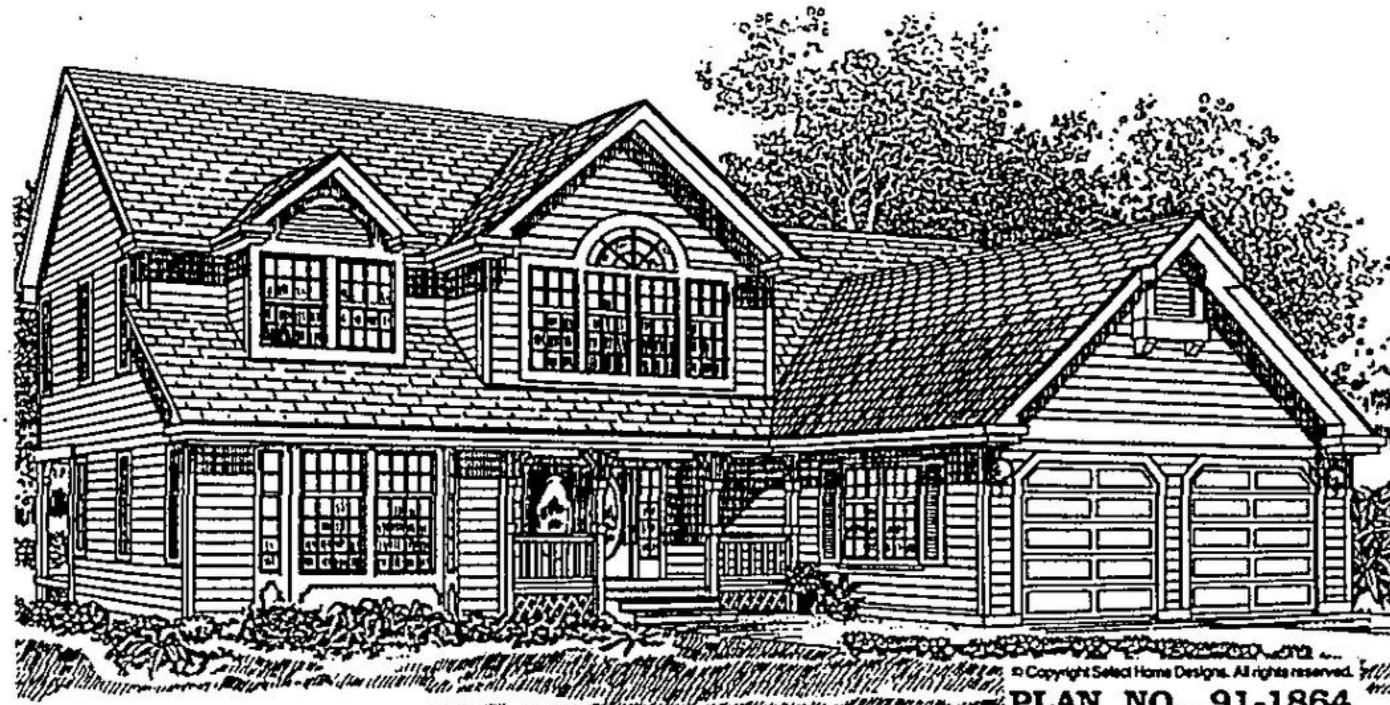
PLAN NO. 91-1864

Brought to you by: DREAMSCAPE - 873-1917 -