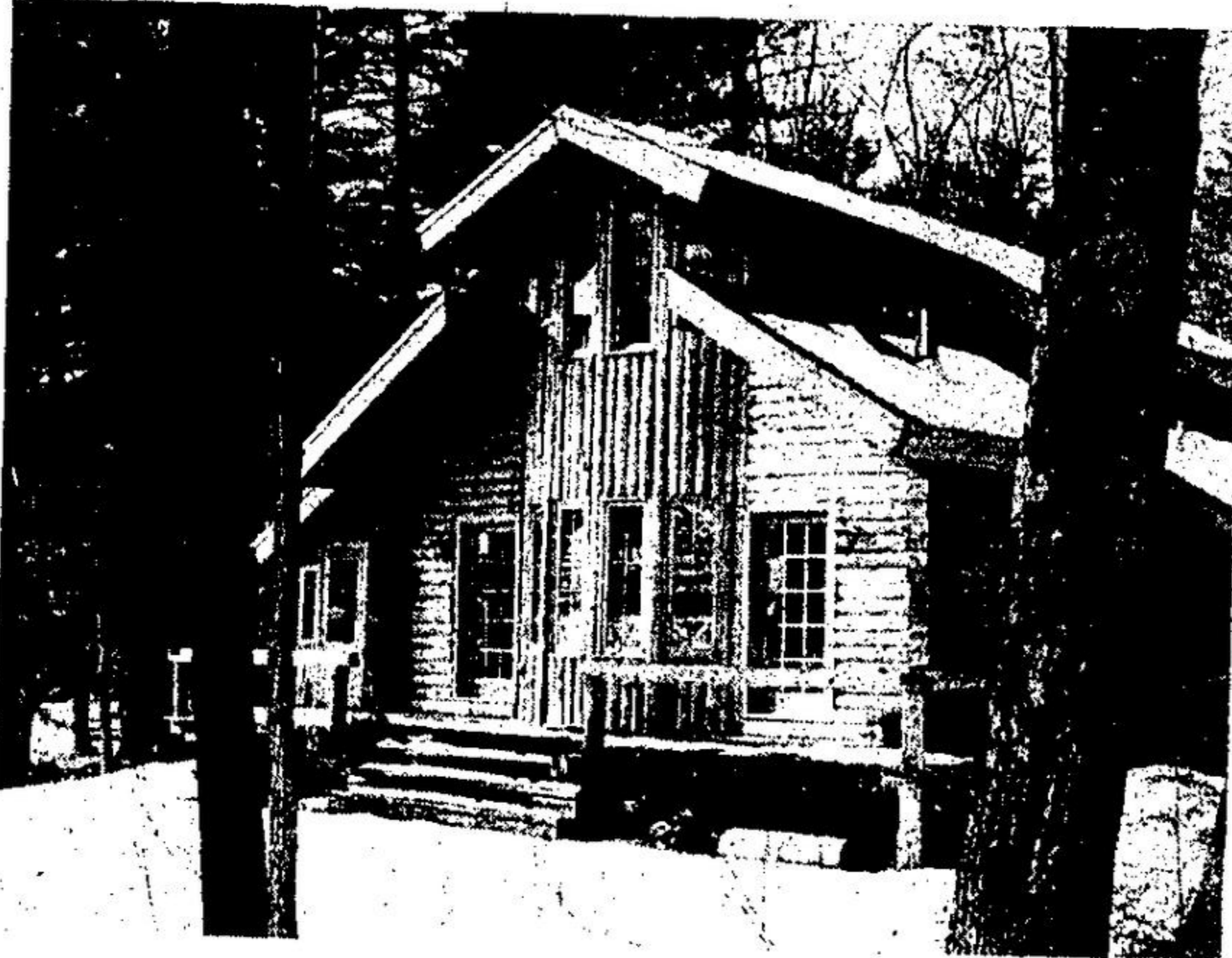
SOME THINGS CAN BE REPLACED