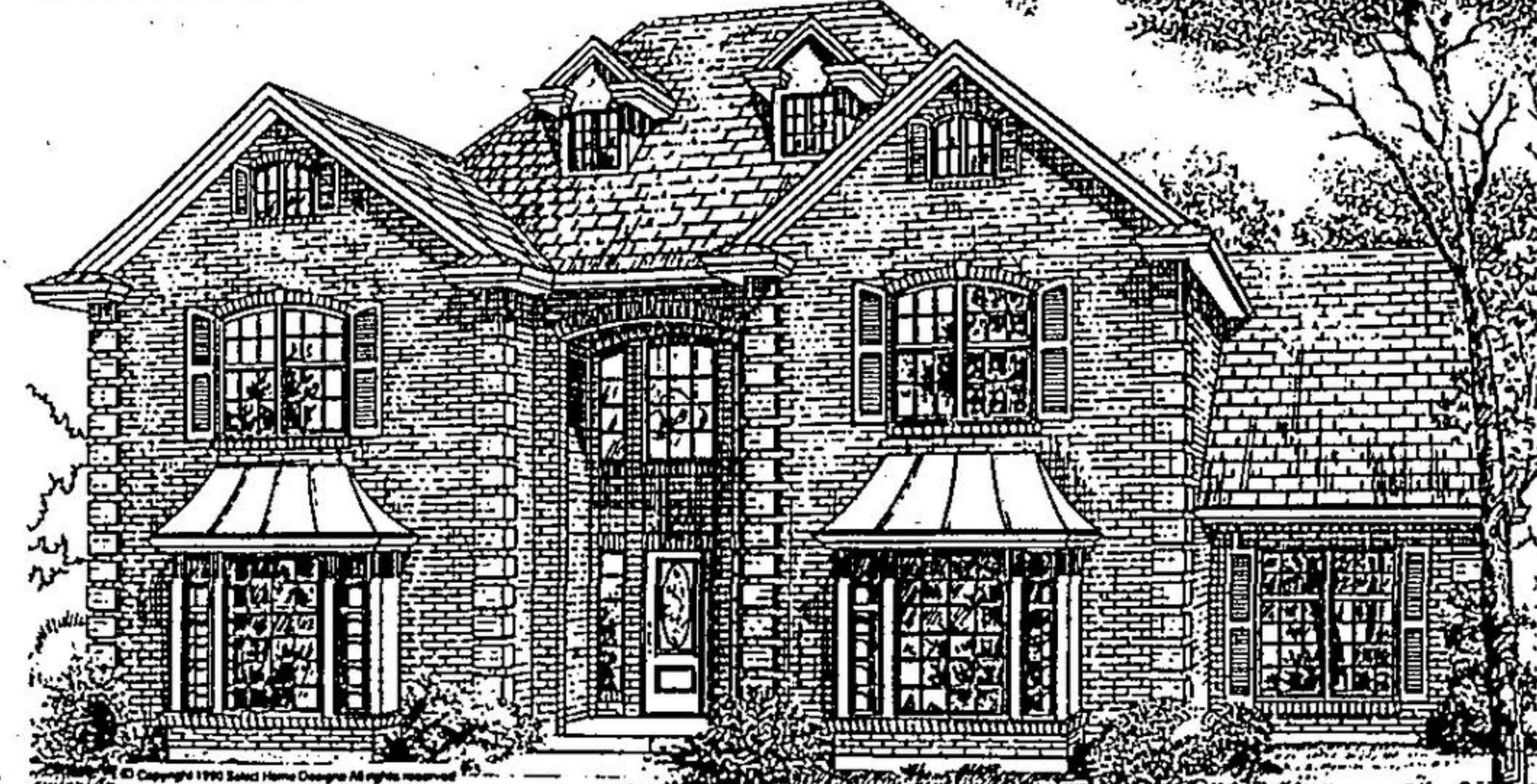
PLAN NO. 90-3822 STATELY EXTERIOR UNVEILS GRACIOUS DESIGN