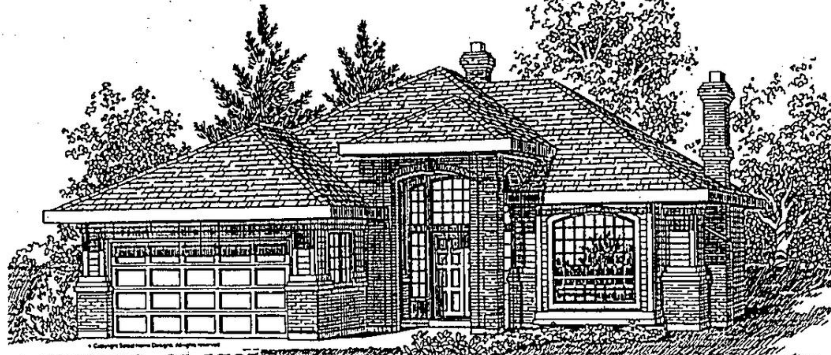
PLAN NO. 91-1785