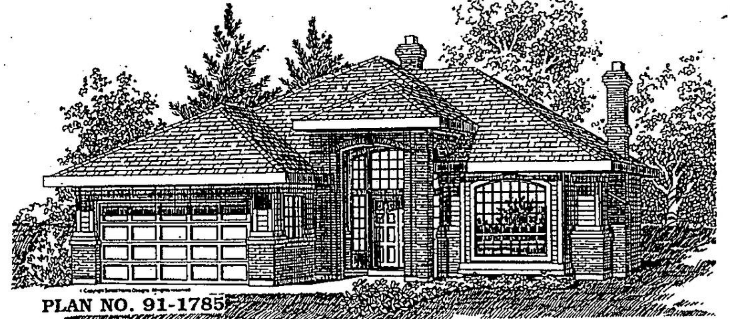
PLAN NO. 91-1785