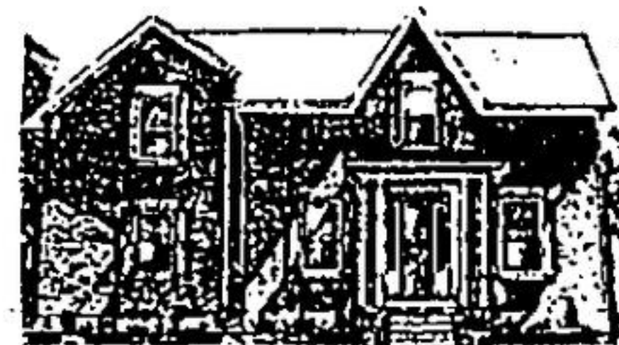
THE INSURANCE HOUSE

A Complete Line Of: *HOME *AUTO *APARTMENT *BUSINESS *CONDO *BOAT INSURANCE