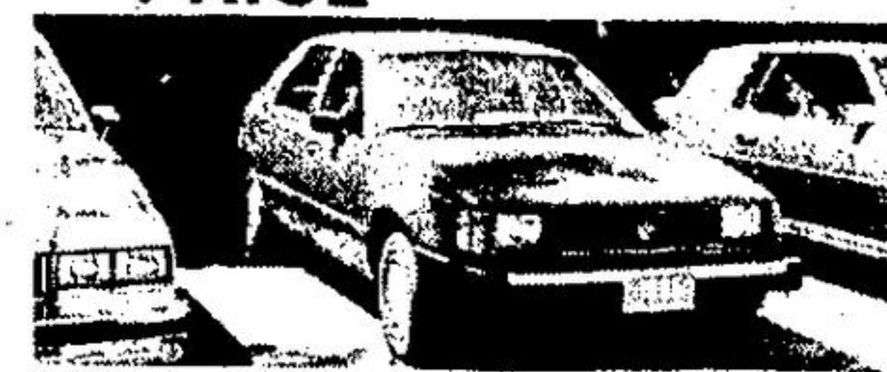
85 MERCURY TOPAZ GS 4 Cyl., Automatic, PS/PB. Stk. No. 4089A