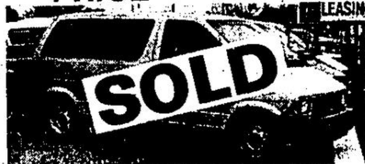
1991 AEROSTAR XL V6, Auto, Air, 7 Pass. Stk. No. 9158