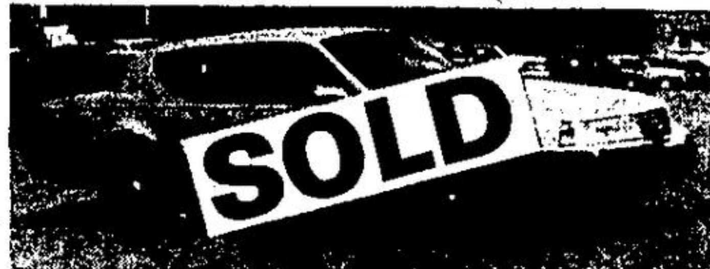
87 COUGAR LS 6 Cyl., Automatic, Loaded. Stk. No. 81168A