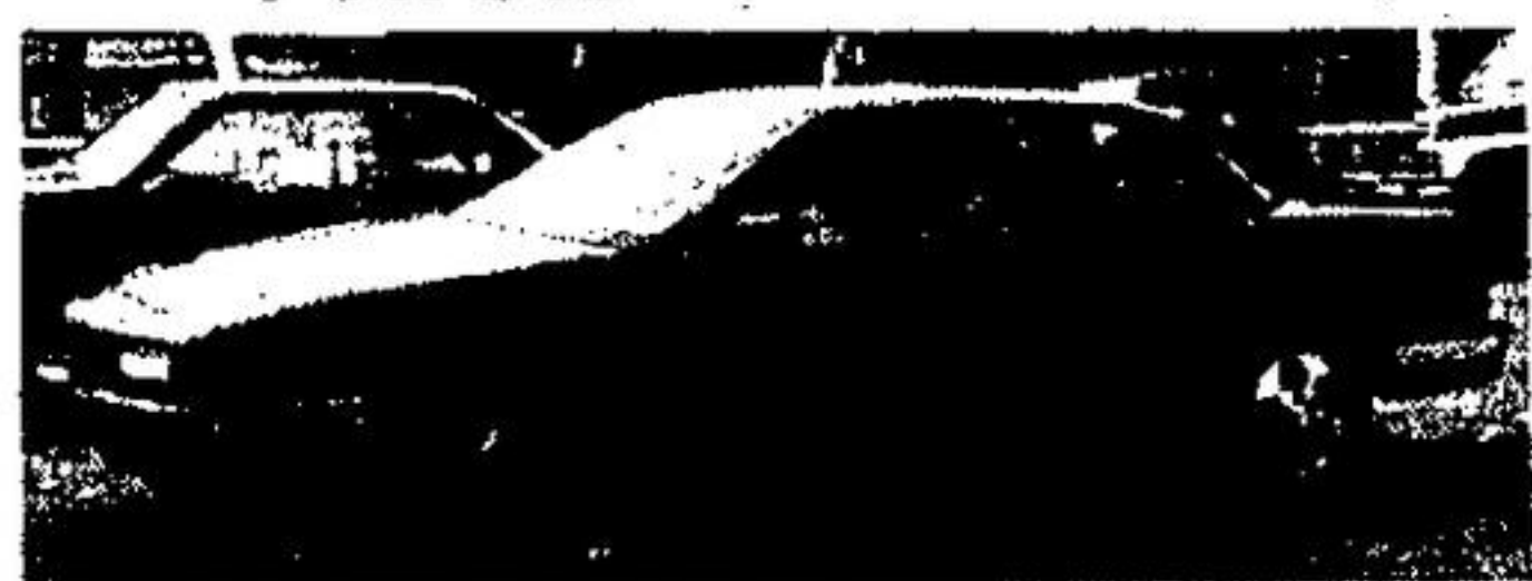
1988 BUICK REGAL LTD. 6 Cyl., Auto, Loaded. Stk. No. 9188