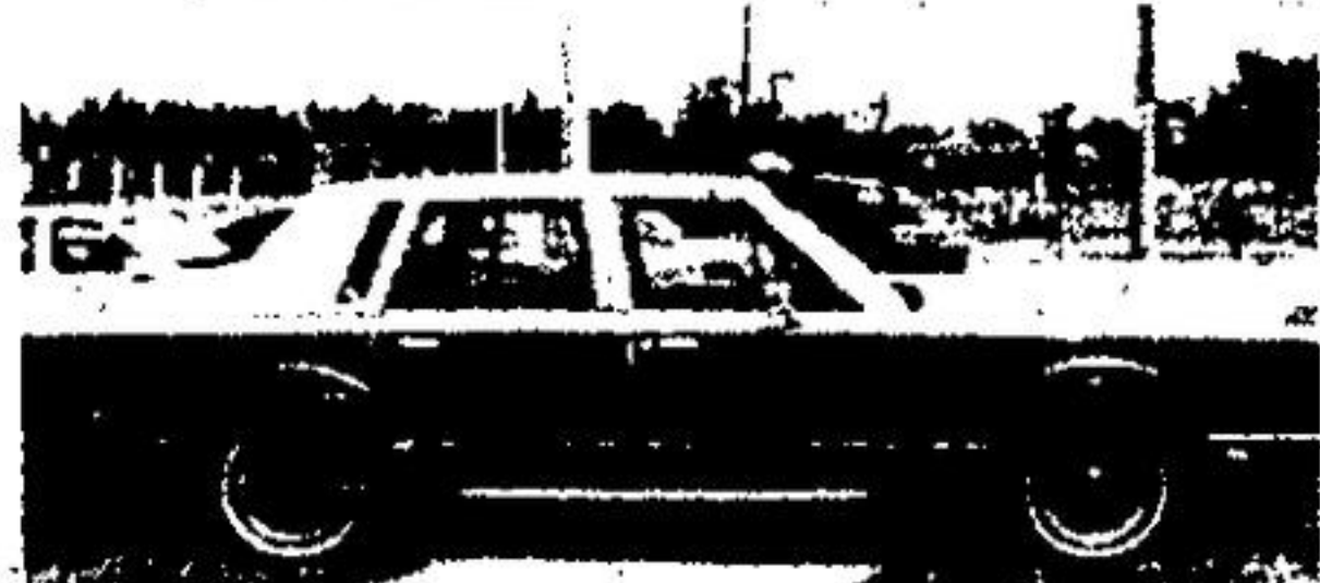
1987 LINCOLN TOWN CAR All Luxury Items. Stk. No. 9125