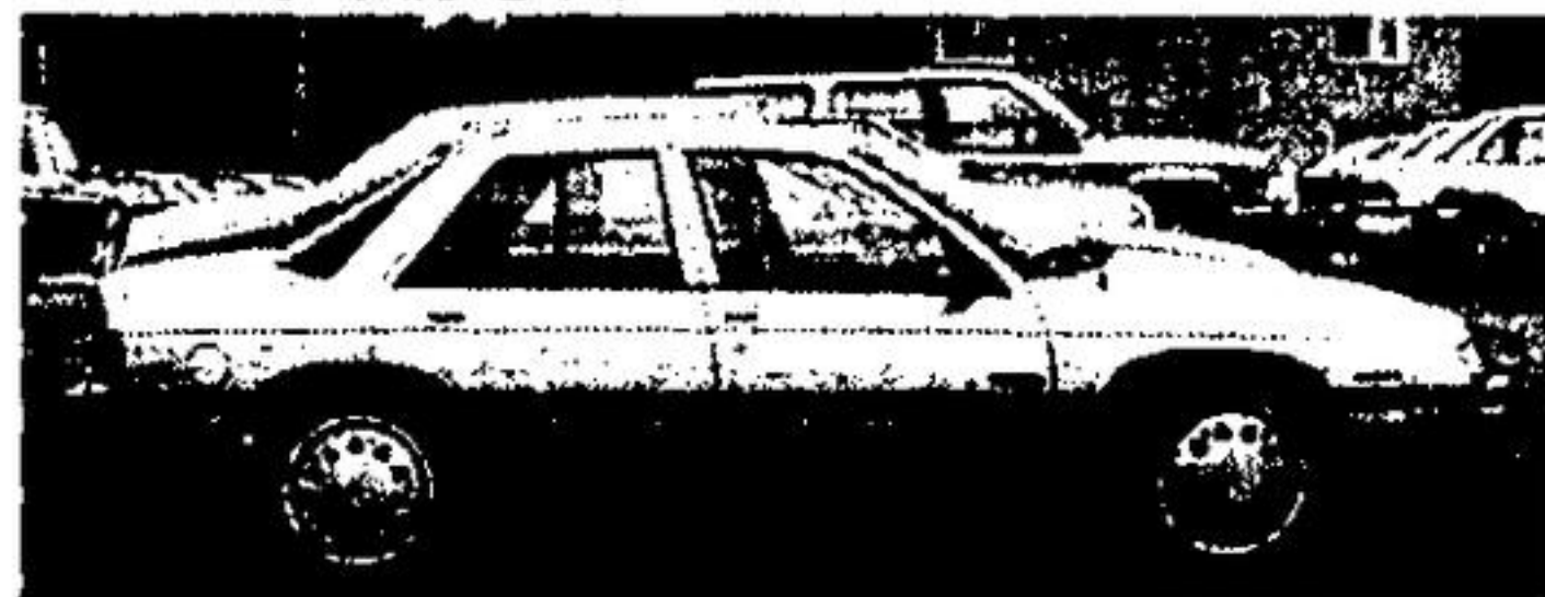
1989 CHEV CORSICA CL 6 Cyl., Air, Automatic