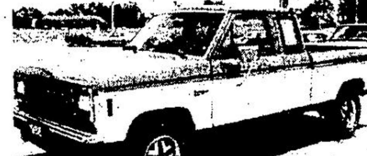
1986 RANGER S/C 4 X 4 6 Cyl., Auto, Air. Stk. No. 80194A