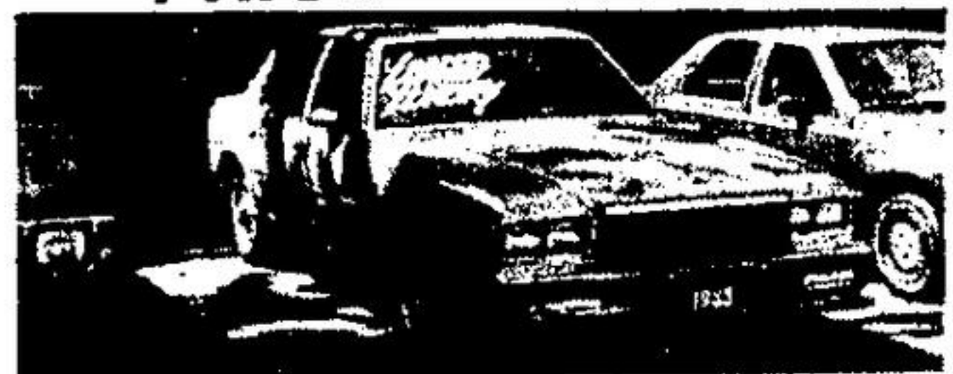
83 BUICK REGAL LTD 8 Cyl., Automatic, Loaded. Stk. No. 4131A