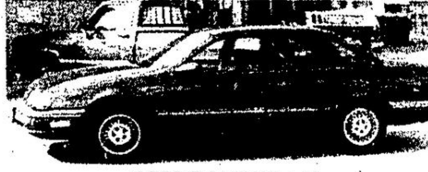
1989 TAURUS LX 6 Cyl., Loaded, Only 34,000 Km. Stk. No. 9182