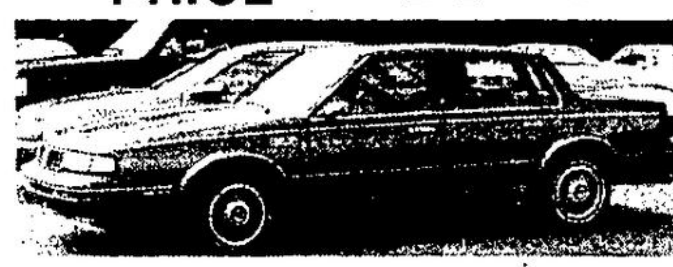
1988 CUTLASS SIERA BRGM 6 Cyl., Automatic, Air. Stk. No. 9188