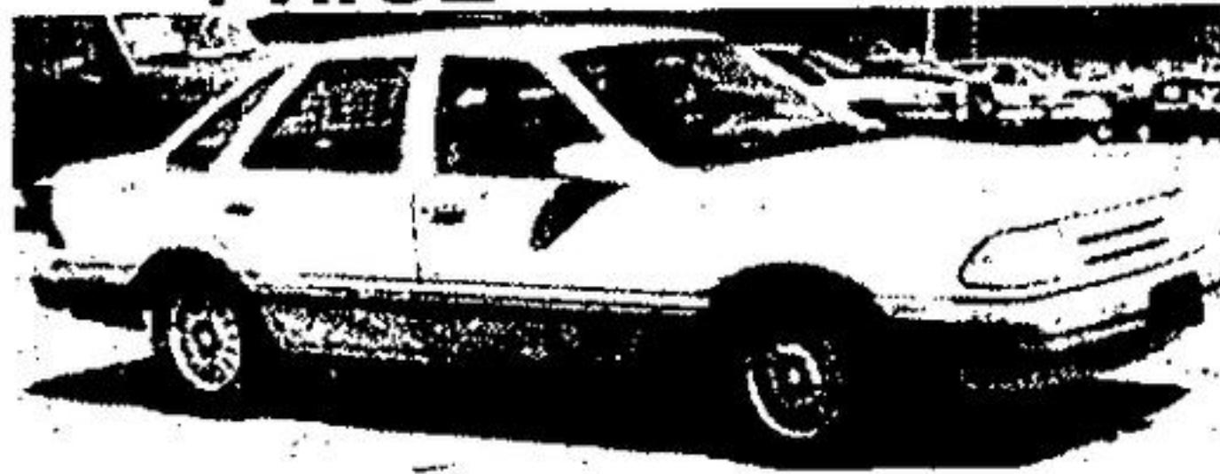
87 FORD TEMPO 4 Cyl., Auto, Air Conditioned. Stk. No. 9173