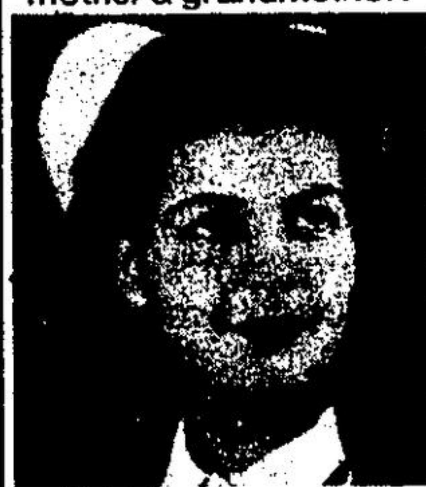
Love: The Gang XOXO