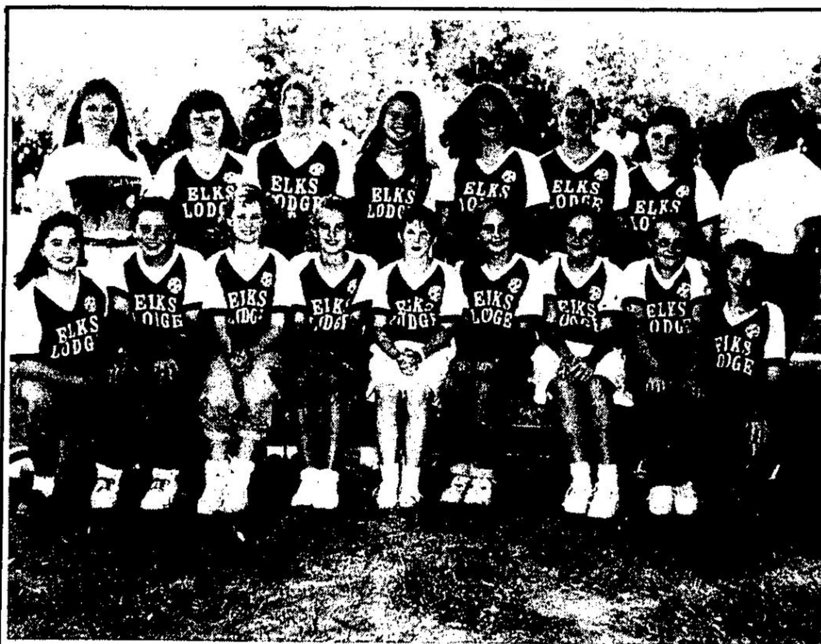
Elks Lodge Intermediates