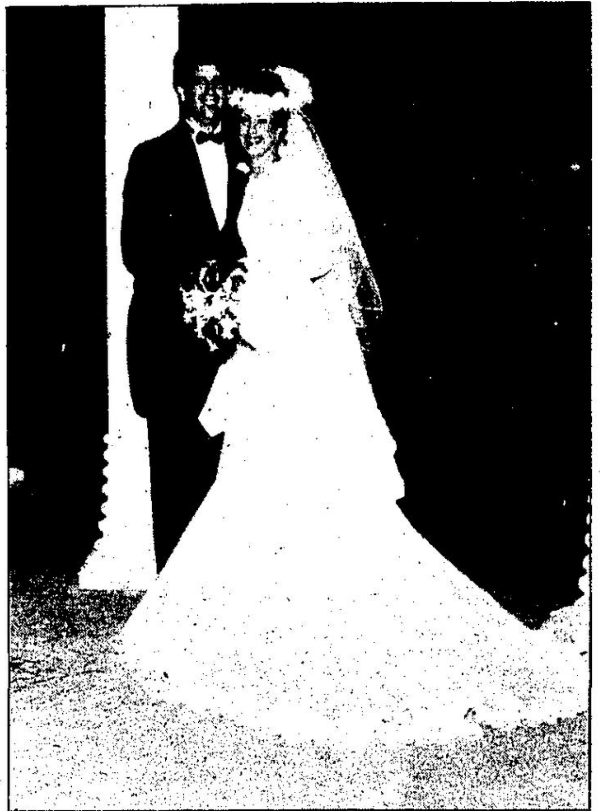
The happy couple