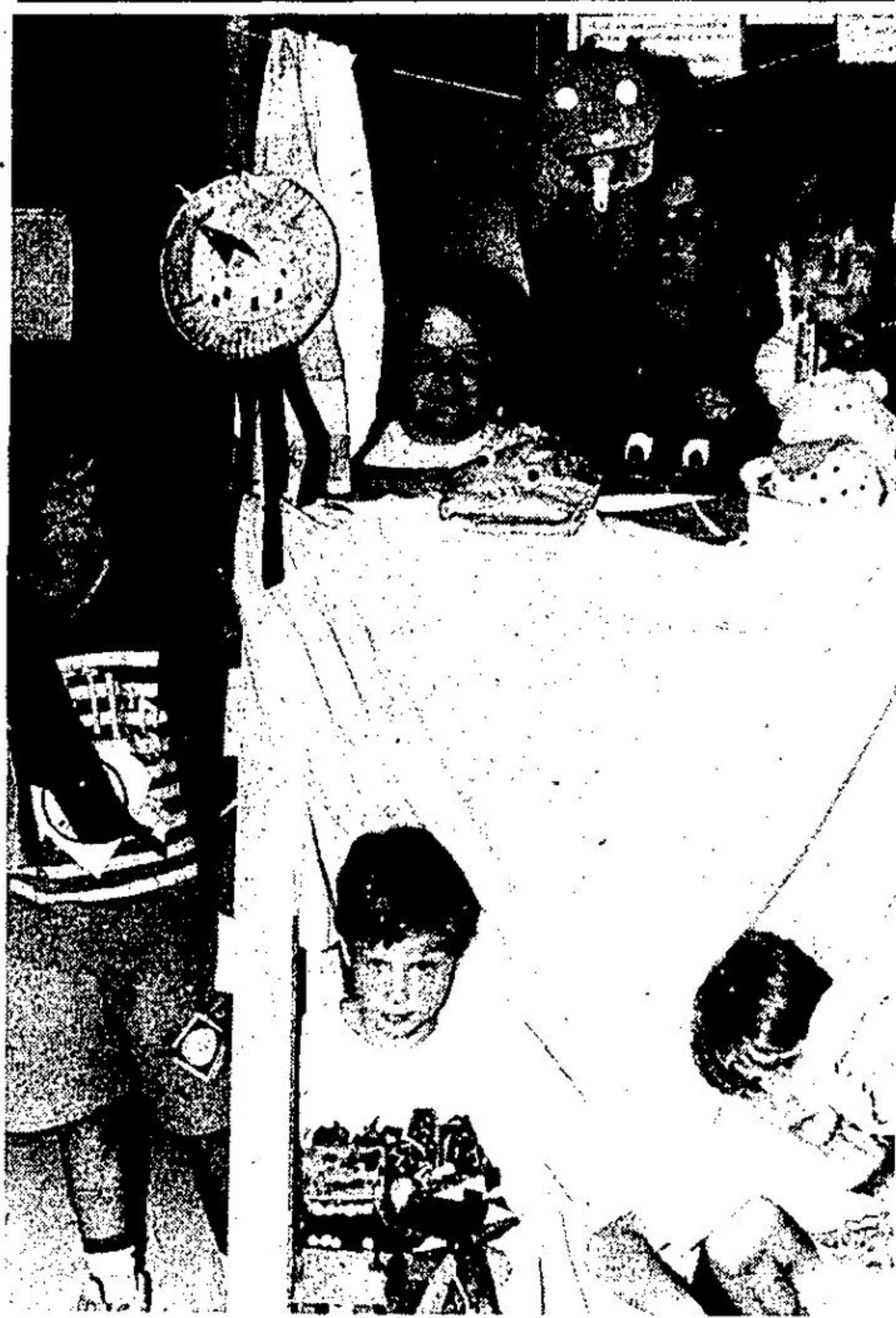
Final curtain call

The hilarity of "Bill and Ted's Bogus Journey" lies in its ability to make fun of the familiar, tacky things in life. Thanks, fellas, the trip was 'excellent!'