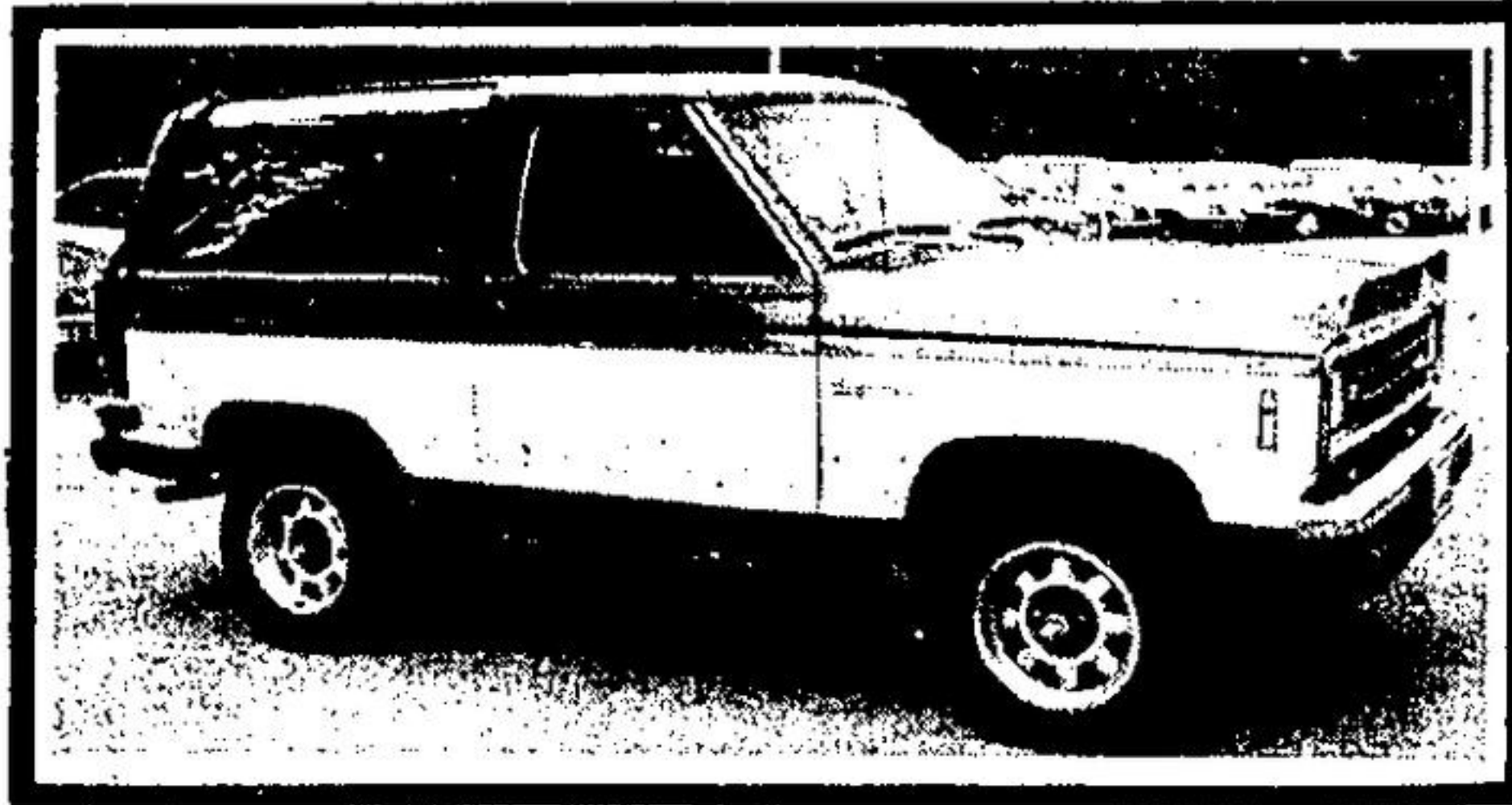
1988 BRONCO XLT 6 Cyl., Auto, Air, Power Locks Stk. No. 9170