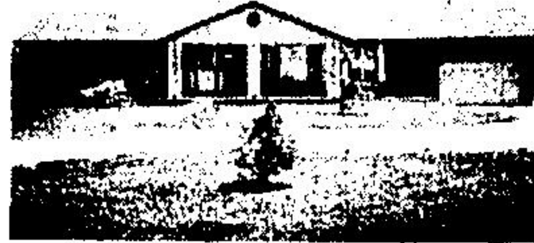
COUNTRY RANCHER $229,000.00

This spacious (1625 sq. ft.) custom built home features a main floor family room/kitchen with cathedral ceiling, skylights, oak cupboards and flooring, air tight stove and slider walk-out. 3 bedrooms with master ensuite, main floor laundry and oversized garage. Call Heather (Whiting) Scotland** at 853-2086. RMAC 91-46