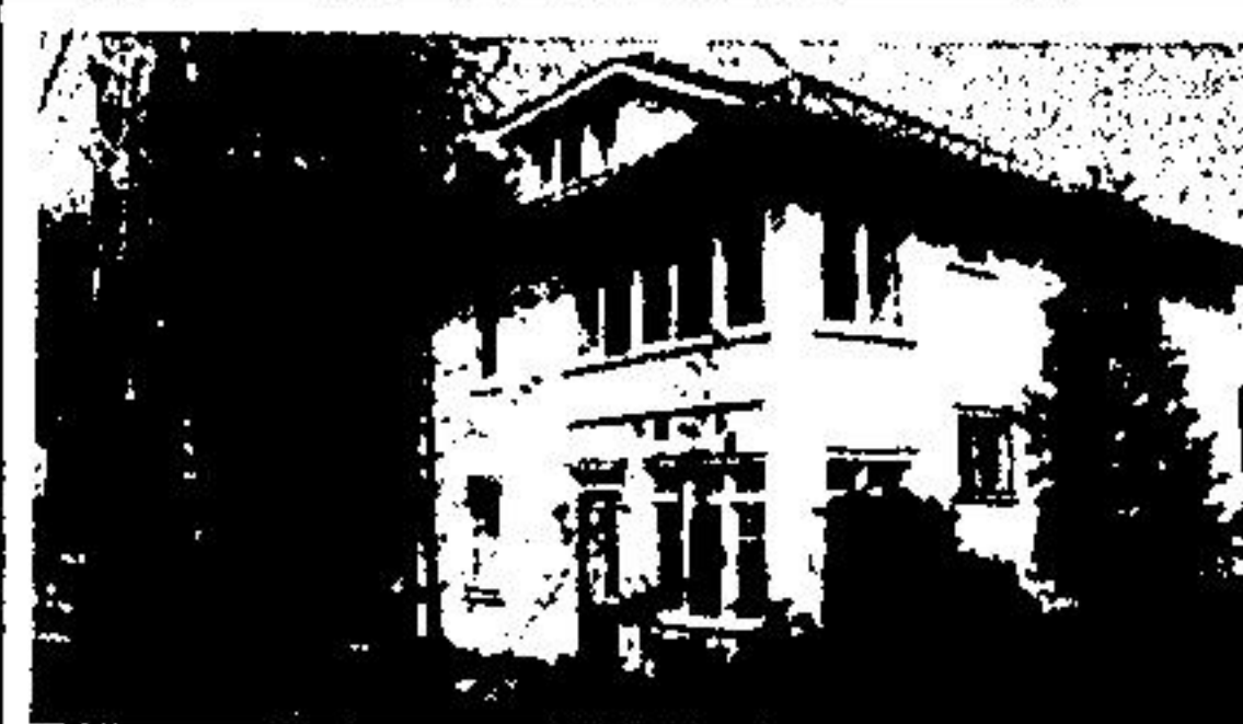
LOVE AN OLDER HOME? $179,900.00

Set on 54.75 acres with highway frontage, nearly completed 3 bedroom home, ideal for farm help. Excellent value and opportunity!!! Call Heather (Whiting) Scotland** at 853-2086. RMAC 91-15