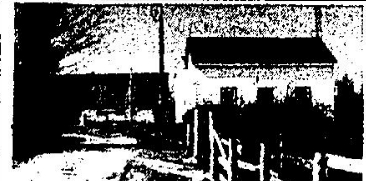
3 FAMILY HOME AND 3 BARNs $349,000.00

This spacious (1625 sq. ft.) custom built home features a main floor family room/kitchen with cathedral ceiling, skylights, oak cupboards and flooring, air tight stove and slider walk-out. 3 bedrooms with master ensuite, main floor laundry and oversized garage. Call Heather (Whiting) Scotland** at 853-2086. RMAC 91-46