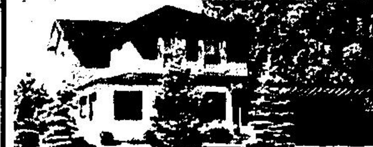
BED AND BREAKFAST?? $399,000.00

Then you must see this 2 storey home with original wood work and plate railing, French doors, fireplace and enclosed porches. The wiring and plumbing are already done... just needs your decorating touches!! Call Heather (Whiting) Scotland** at 853-2086. RMAC 91-40