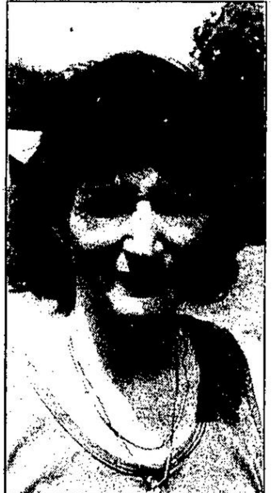
Lynda House, Norval: "I think they are a very good team. I went to see them play just last Saturday. They will probably win."