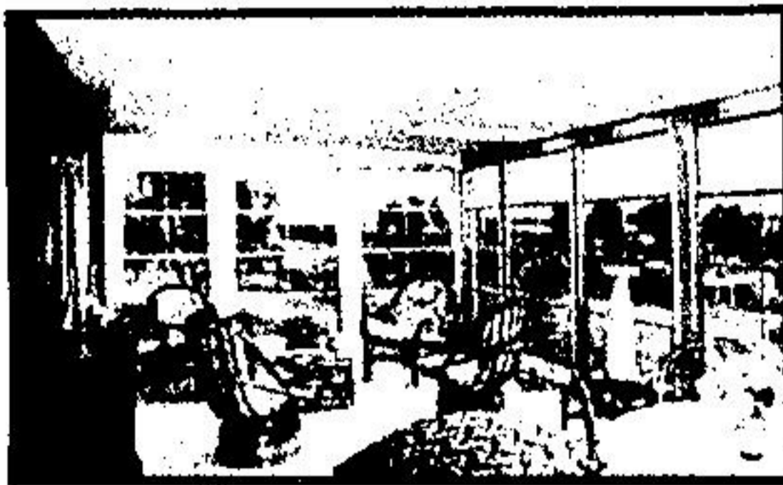
ELASTO VINYL — Light Weight and Super Strong

• With WEATHERALL you'll never feel closed in... slide all four panels into one and you'll have an open air screen room. • Foul weather days... just slide panels closed and you'll have a comfortable weather sealed room without losing your view