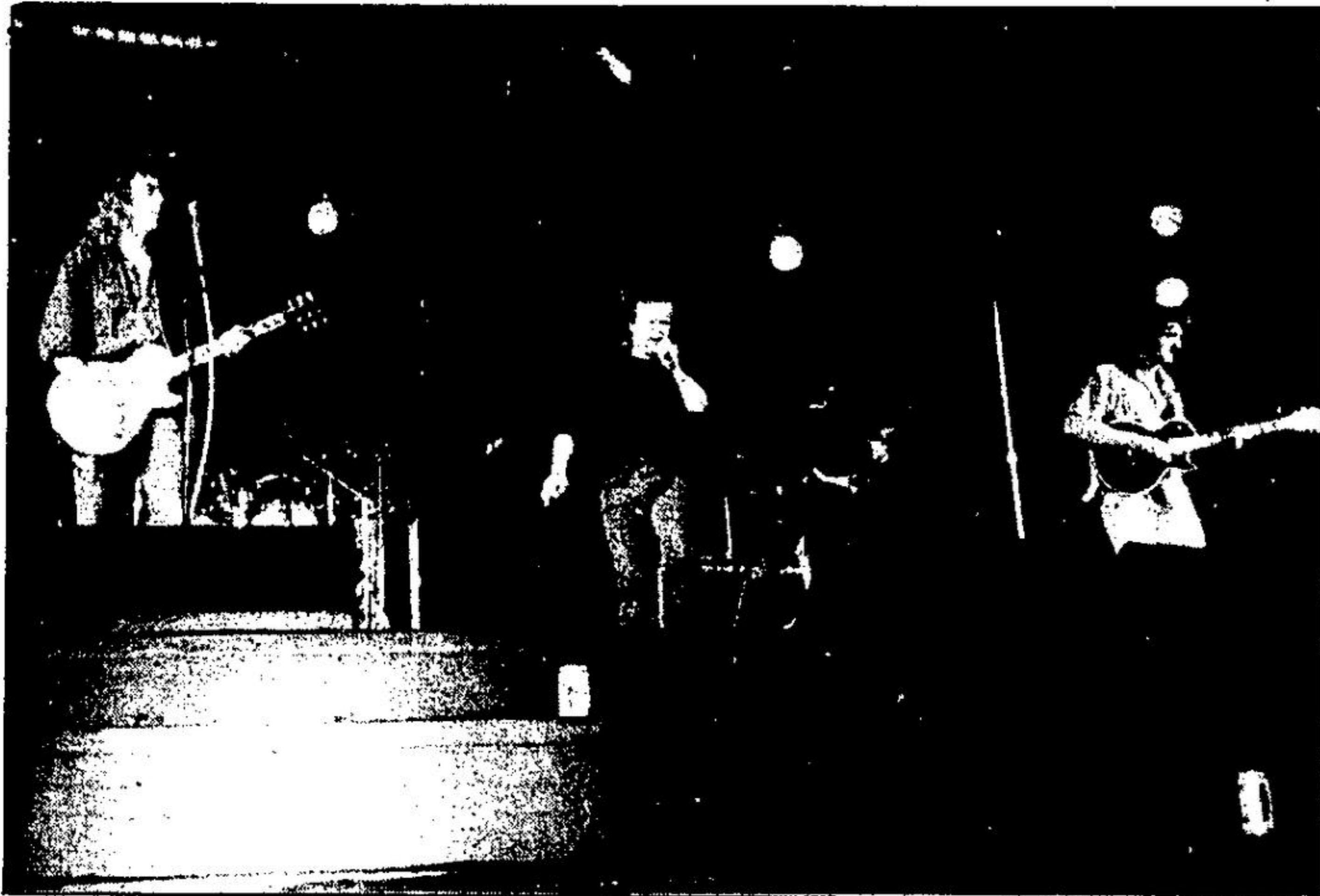
THE ORIGINAL HOTEL CALIFORNIA