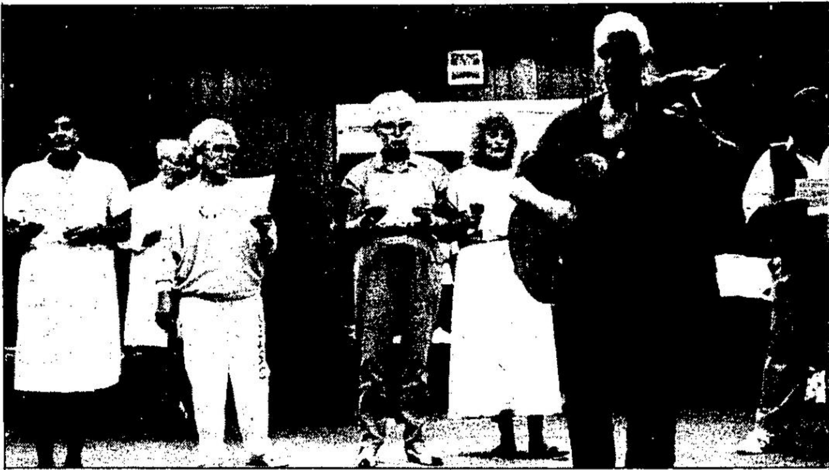
Music sheets in hand, members from GLT, Globe, the Choral Society and the community rehearse for Operation '91. The Georgetown Hospital Benefit Show will be held June 21st and 22nd at the John Elliott Theatre.