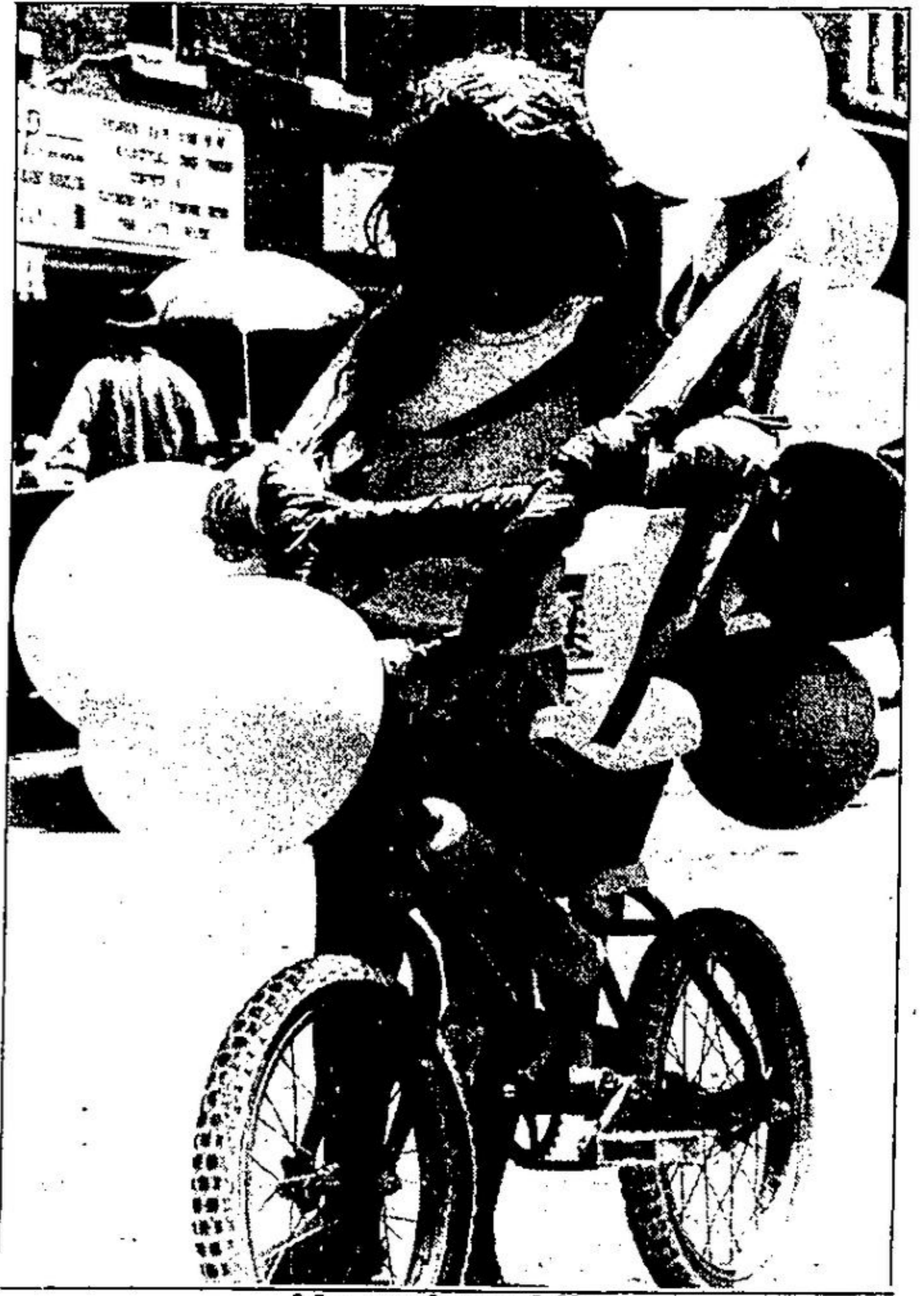
Me and my bike

The program will run Sunday mornings from 10 a.m. - 12:15 p.m., June 30th through August 25th. So come on out for some summer time fun. See y'all at Pioneer Days!