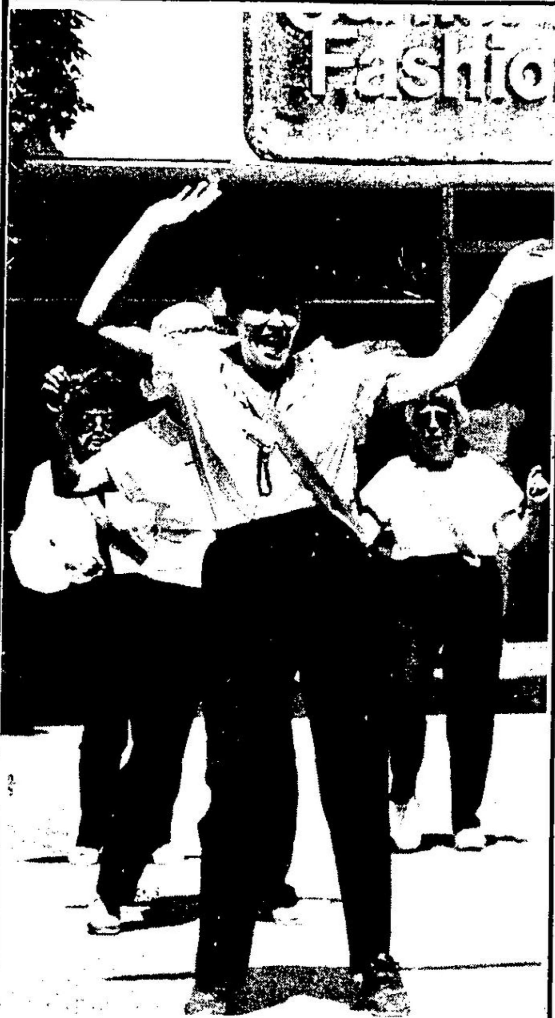
Into the swing

Everybody was getting into the swing of things at last year's Pioneer Days.