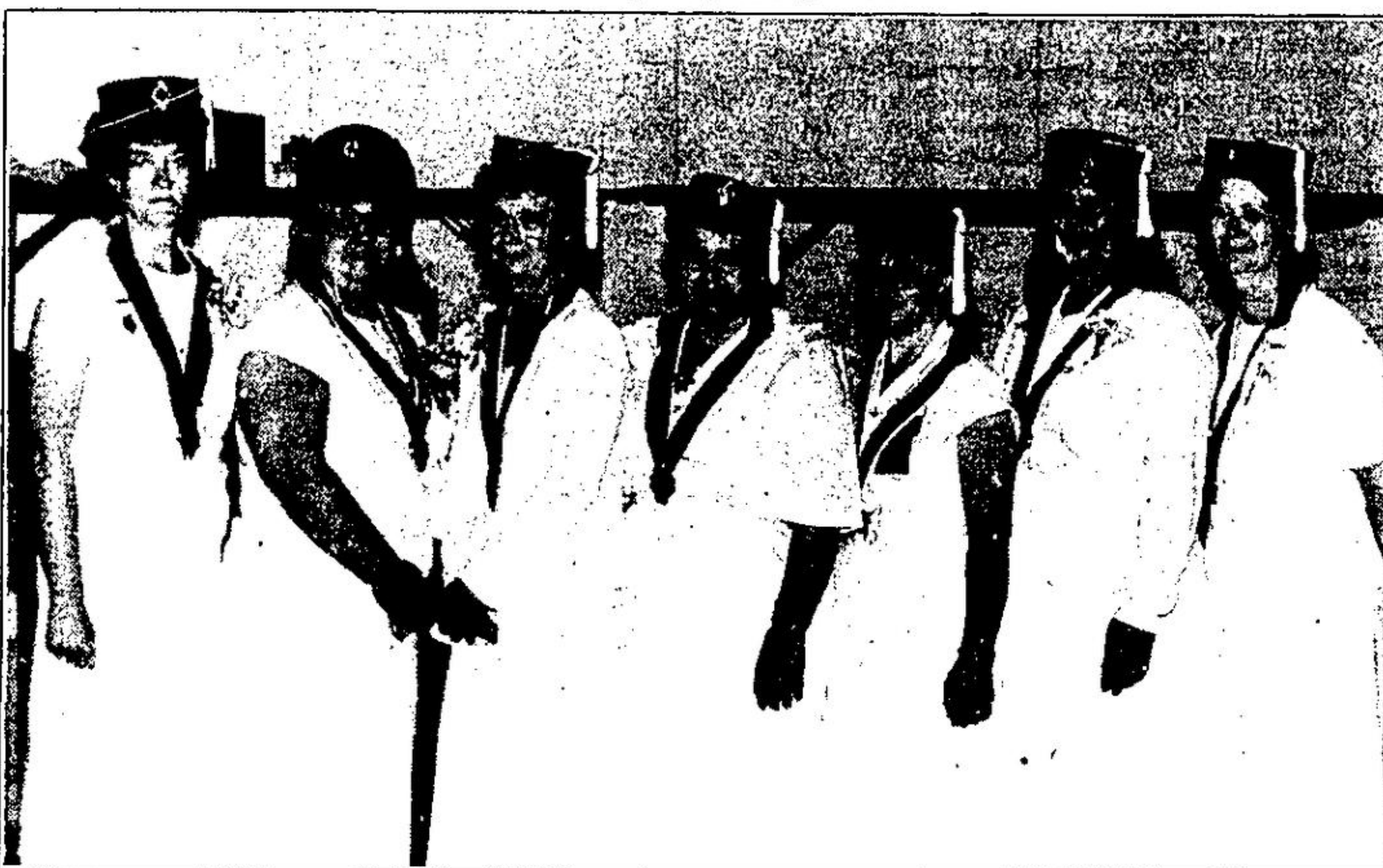
Royal Purple executive

Halton Region, have been considering the pilot project since the province announced two years ago that $100 million would be made available to Ontario hospitals for the establishment of innovative health care projects, according to a Regional Health department staff report.